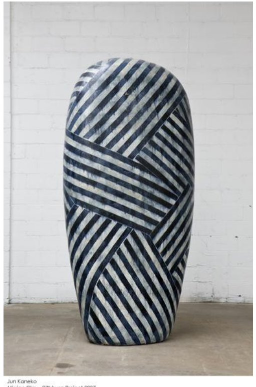
Jun Kaneko Mission Clay - Pittsburg Project 2007 Unfilled, Dango, glazed ceramics, 9.5' high x 4' wide

2. Jun Kaneko (Japanese, born 1942, active in the United States since 1963), Untitled, Mission Clay Pittsburg Project , 2004-2007, glazed ceramic, 104<sup>1</sup>/<sub>4</sub> x 21<sup>3</sup>/<sub>4</sub> x 56<sup>1</sup>/<sub>4</sub>". Aldine S. Hartman Endowment Fund (2011.2).