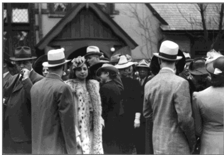
Crowds Outside of a Fashionable Negro Church After Easter Sunday, Chicago, Bronzeville, April 1941, Edwin Rosskam