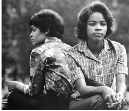
Washington Square, New York City, 1960