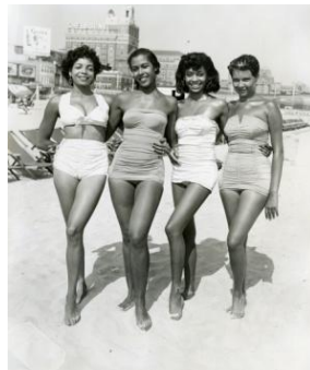
Atlantic City, Four Women, c.1960s