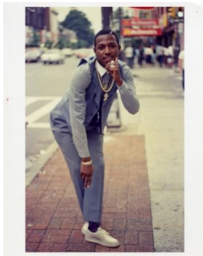
Rude Boy From Back in the Days, 1980, Jamel Shabazz