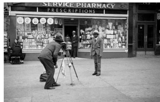
Street Photographer, New York, 1935-1936, Russell Lee