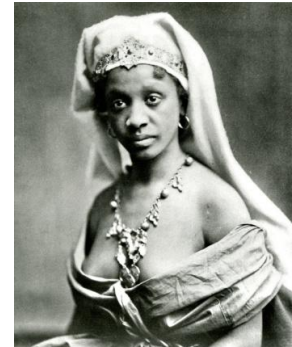
A Desert Queen, 1898. Edward Curtis