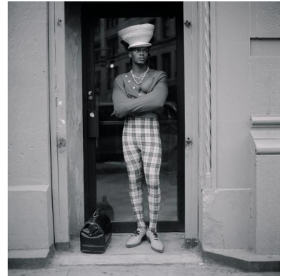
Young Man in Plaid, New York City, 1992