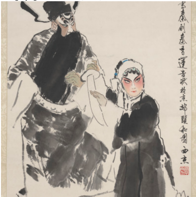
On the Rio Grande (Rio Grande November)

Walter Ufer, American, 1876 - 1936 (Artist)