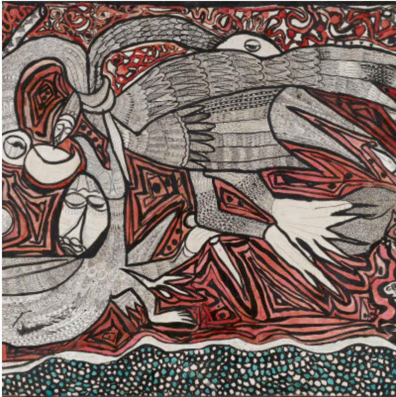
Qin Opera of Qin Xianglian