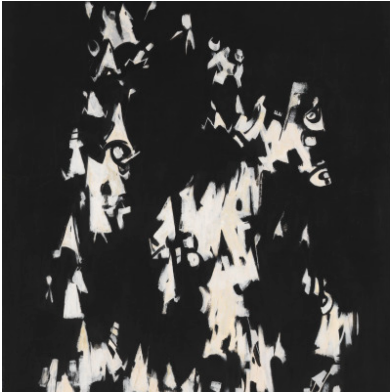
Mother Goose Melody

Helen Frankenthaler, American, 1928 - 2011 (Artist)