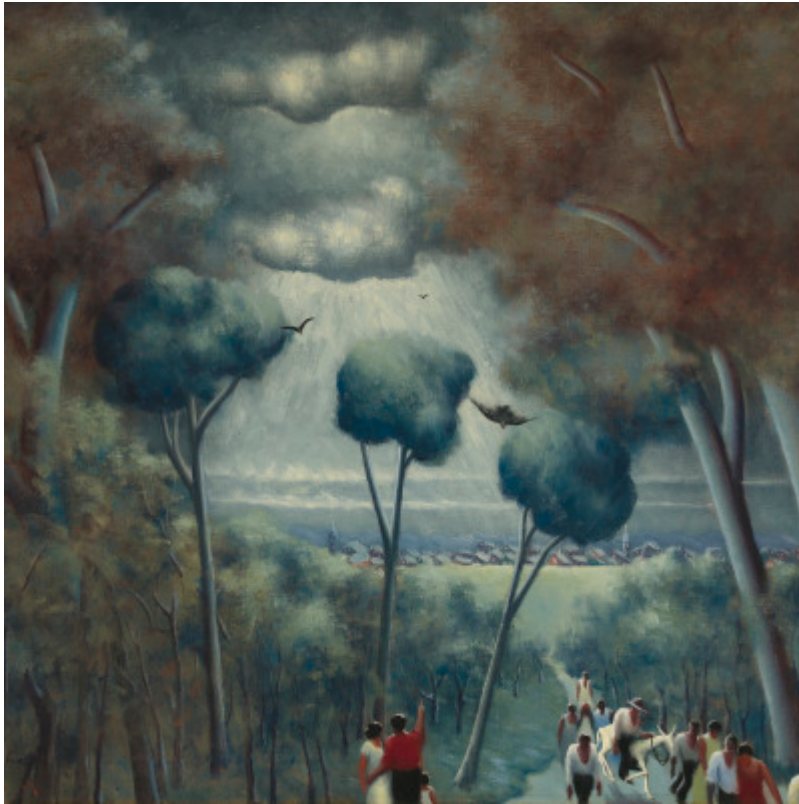
On the Rio Grande (Rio Grande November)

Walter Ufer, American, 1876 - 1936 (Artist)