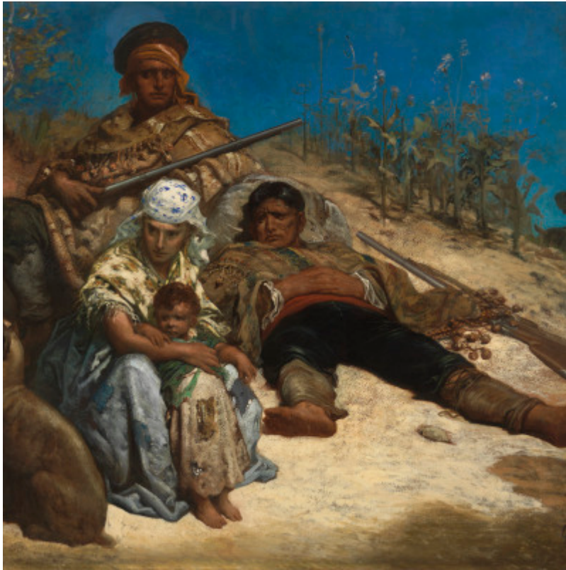
A Family of Spanish Smugglers