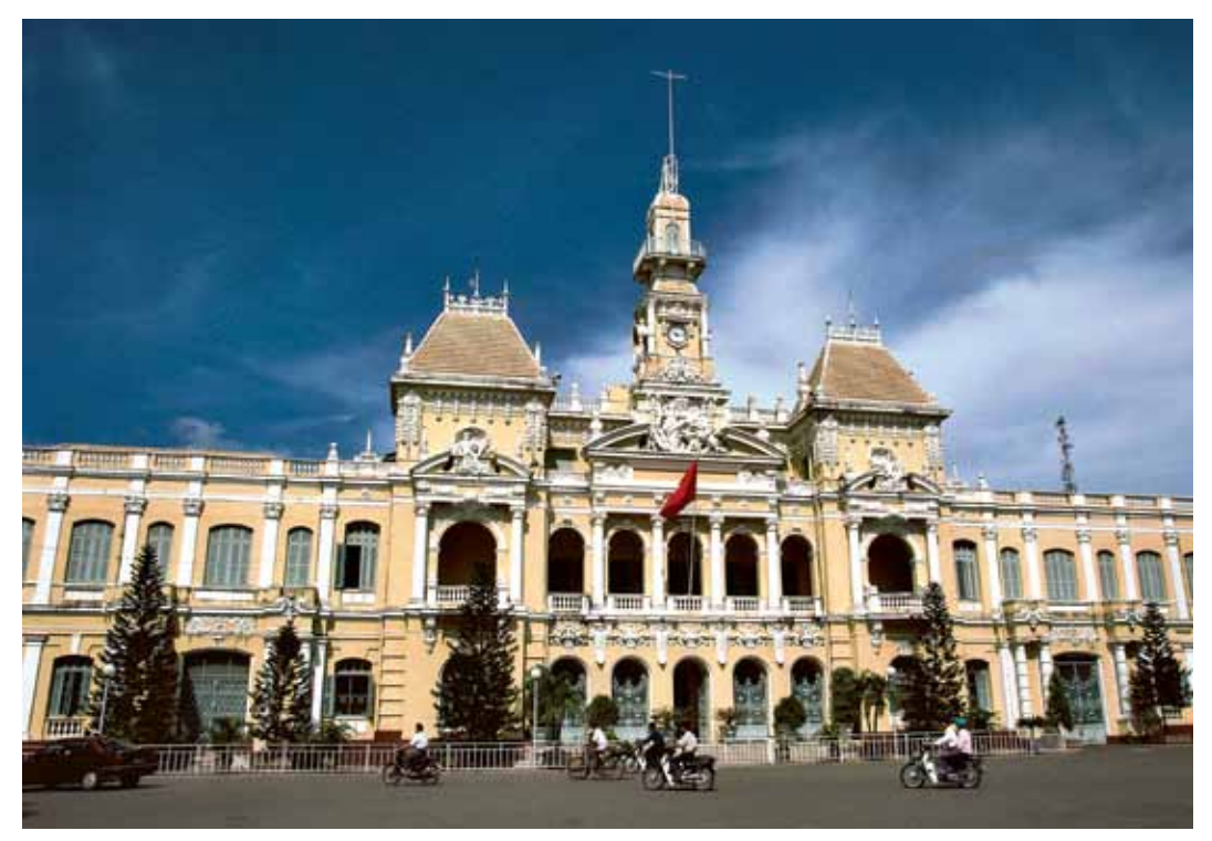
Observe the French architectural influences during an orientation tour of Hanoi on Day 3.

village where many ancient traditions still hold sway. A UNESCO World Heritage site, Hoi An's Old Town is a charming car-free pedestrian zone lined with tailors, shops, and art galleries. This afternoon is at leisure to either remain in Hoi An on your own or return to our beachside resort for a relaxing interlude. B