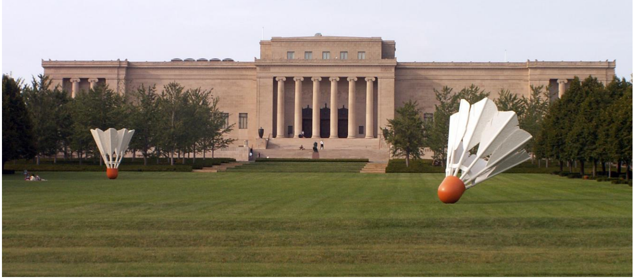
"Nelson-art-gallery1".

After breakfast on day two, we will begin our day with a visit to the Kemper Museum of Contemporary Art and have lunch there at Café Sebastian. Then we will move to the recently renovated Nelson-Atkins Museum, with the new addition designed by Stephen Holl Architects (currently the architects for the VCU Institute for Contemporary Art).