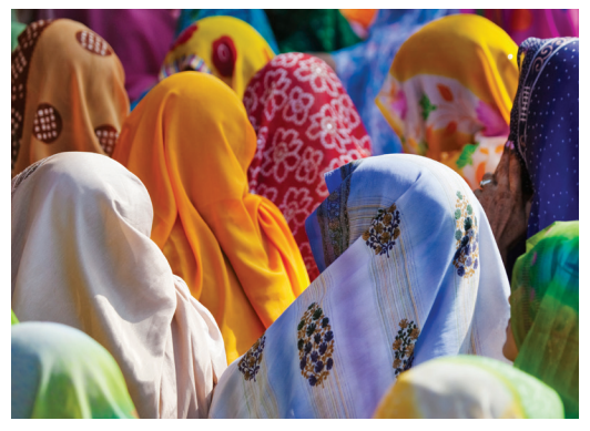
Colors of India

Day 13: Houseboat Cruise Today we see Indian life up close as we slowly cruise past small farms and villages, and old temples and churches, with stops on occasion to go ashore. B , L , D