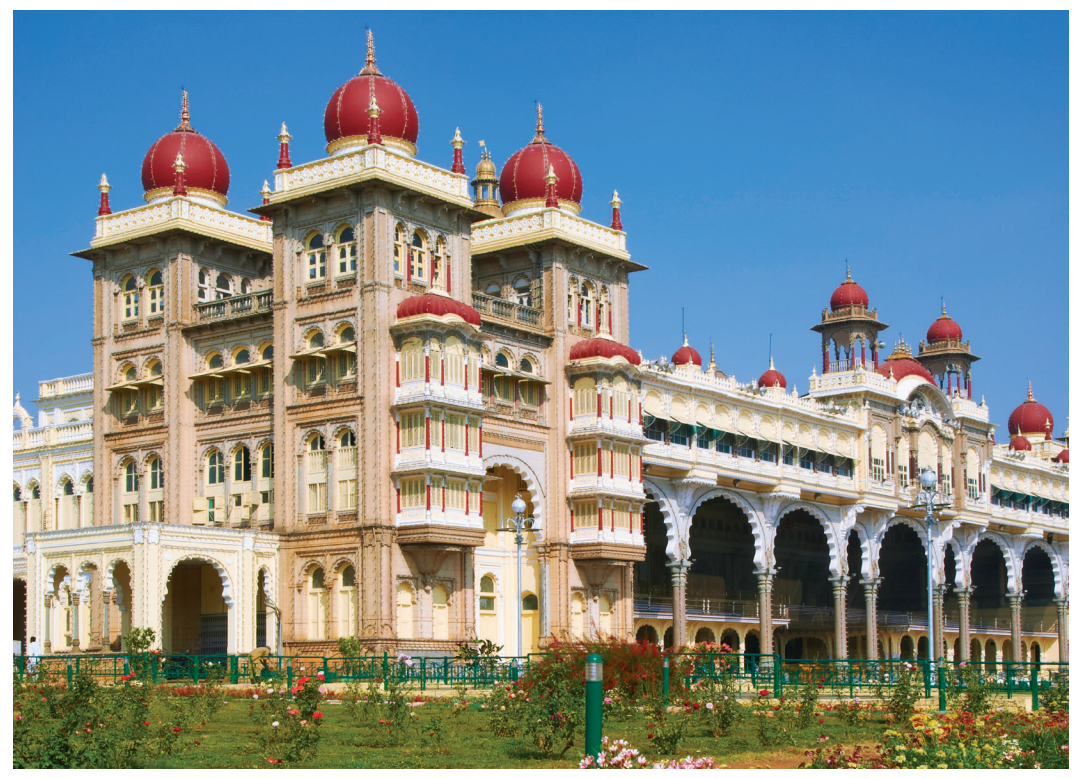
We visit Mysore Palace on Day 10.

Day 7: Coorg/Kabini After an early morning bird watching walk, we leave Coorg for Nagarhole National Park, whose abundant wildlife, including Bengal Tiger, Asian elephant, Indian bison, wild dog, deer, antelope, and hyena, make it one of India's finest preserves. We enjoy lunch at our safari lodge, named one of National Geographic Traveler's 25 "world's best" eco-lodges, then set out on a boat safari through some of Nagarhole's 247 square miles B,L,D