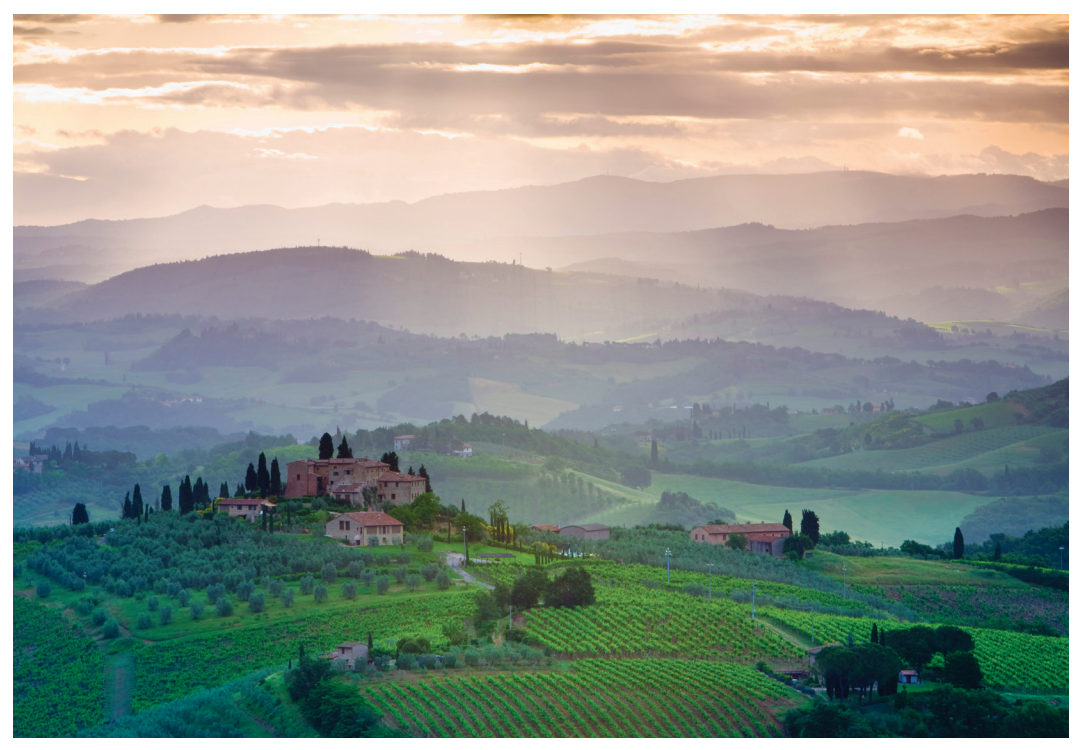
We spend four nights in beautiful Tuscany.

Day 6: Santa Margherita/Portovenere/Cinque