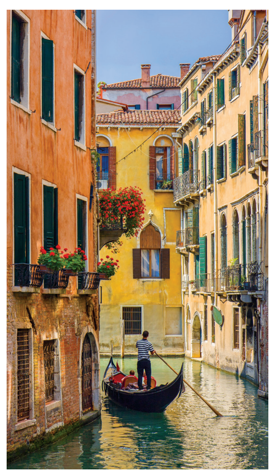
Our tour ends in timeless Venice.