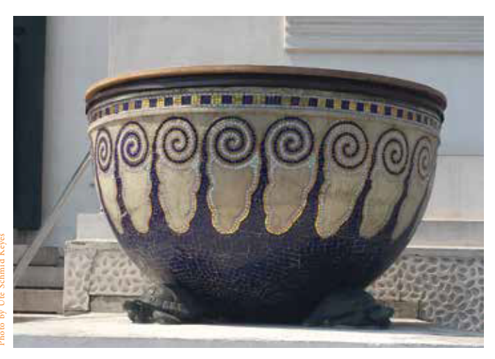
Entrance to the Secession Museum