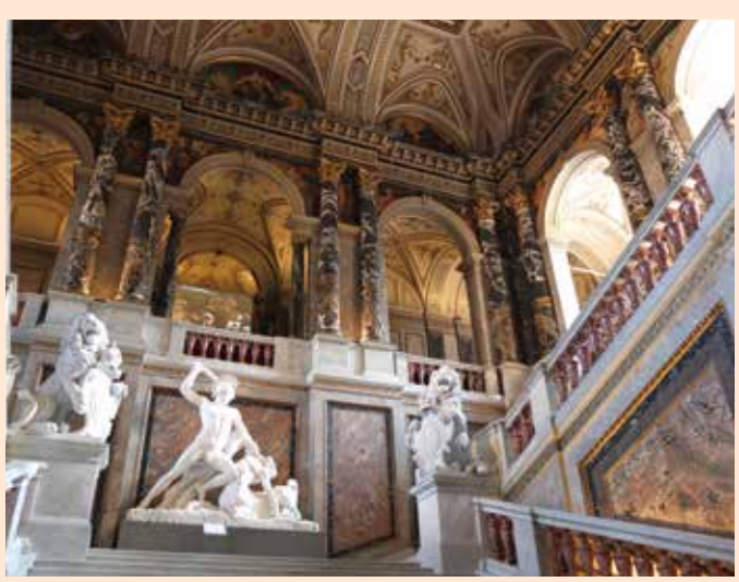
Sacher-Torte, Hotel Sacher. Photo by Patrizia Ferraglioni (top); Kunsthistorisches Museum. Photo by arjunalistened (above).