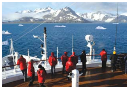
Forward Observation Deck