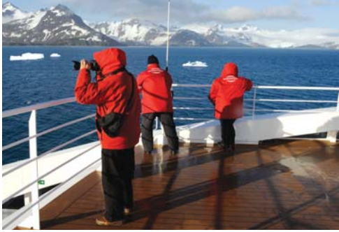
Stand on the bow of M.S. LE SOLEAL and watch Antarctica's drama unfold before you.