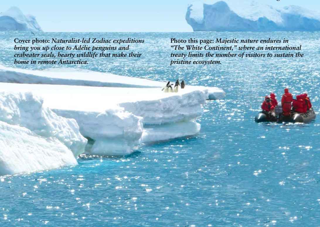
Photo this page: Majestic nature endures in "The White Continent," where an international treaty limits the number of visitors to sustain the pristine ecosystem.

Cover photo: Naturalist-led Zodiac expeditions bring you up close to Adélie penguins and crabeater seals, hearty wildlife that make their home in remote Antarctica.