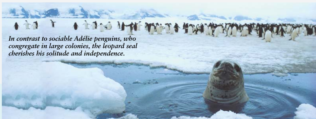
In contrast to sociable Adélie penguins, who congregate in large colonies, the leopard seal cherishes his solitude and independence.

In Paradise Bay, awesome cliffs of ice descend from the surrounding mountains into the floating iceberg-laden waters along the western coast of the Antarctic Peninsula.