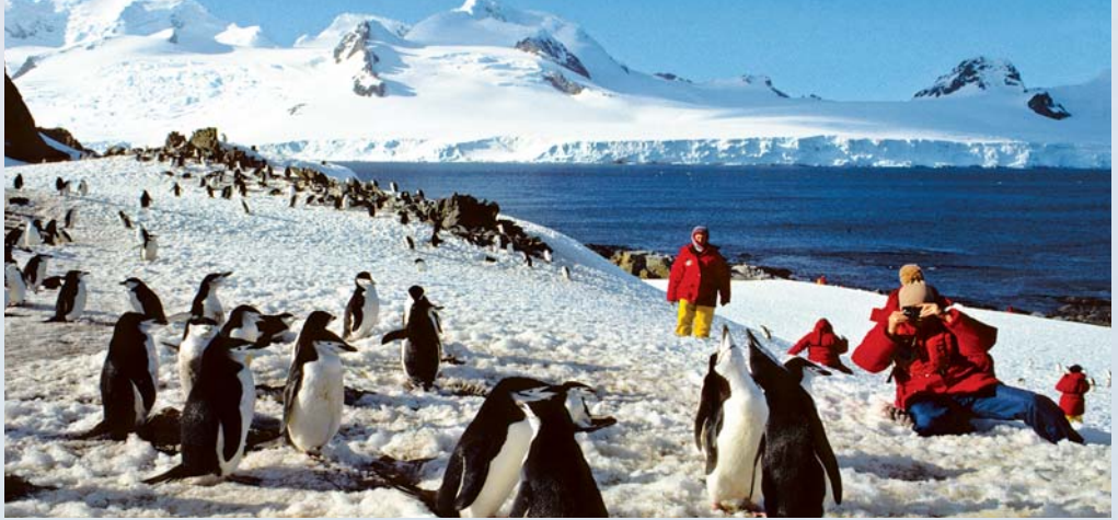
A visit to Antarctica offers an unparalleled opportunity to get an up-close view of chinstrap penguins in their natural habitat.

Named by 19 th -century whalers who sought shelter in its coves, Paradise Bay is an ideal sanctuary for marine wildlife including humpback whales, crabeater seals and Cape petrels.