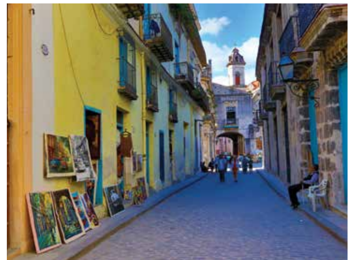
Orchid farm, Soroa (left) and Old Havana (right)