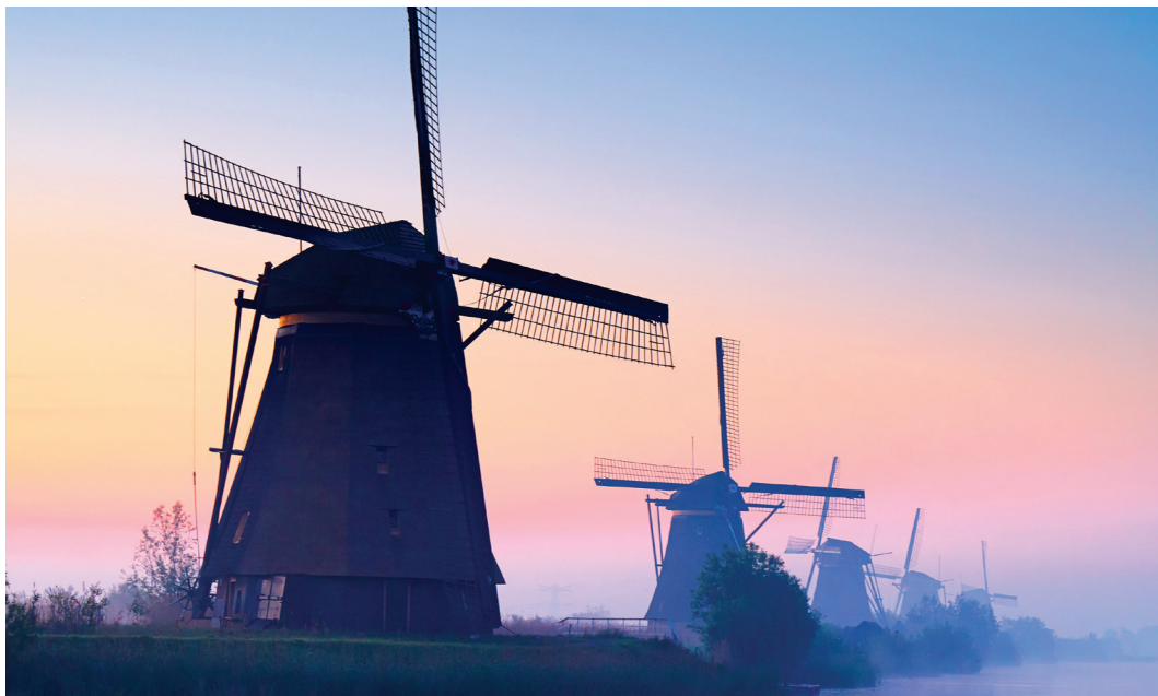
Kinderdijk's windmills date to medieval times.

date to medieval times and still operate today. After lunch, we depart for Bruges, arriving late afternoon. Dinner tonight is on our own. B,L