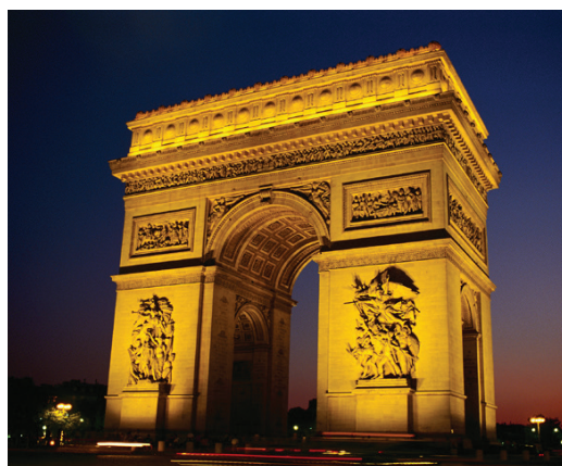
L'Arc de Triomphe, Paris