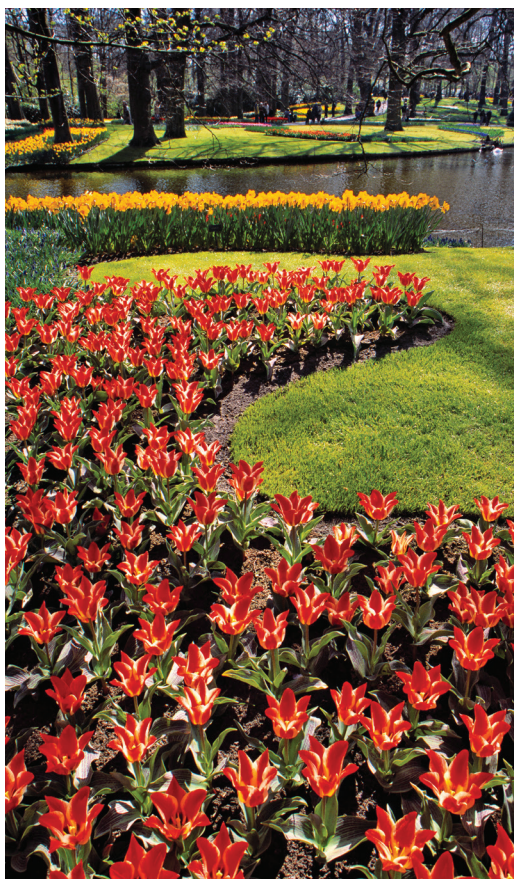
Spring flowers in bloom, Keukenhof

Day 12: Depart Paris for U.S. We transfer to the airport this morning for our return flight to the United States. B