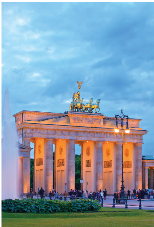
We see Berlin’s Brandenburg Gate on Day 13.