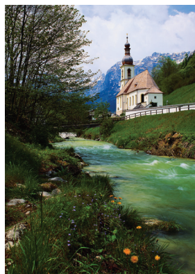
Serene German countryside

Day 13: Berlin Germany’s capital, its largest city, cultural center, and beating heart, Berlin is both provincial and international, historic and up-to-the-minute, sophisticated and friendly. We get our first taste on this morning’s tour featuring the Brandenburg Gate, the triumphal arch now a symbol of reunification; and Pergamon Museum housing treasures from the Turkish archaeological site. We visit the Berlin Wall Memorial, the remaining section of the partition that brutally divided the city – and the nation – from 1961 to 1989. Now a historical monument and tribute to victims, the memorial traces the history of the