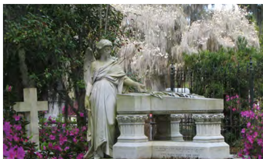
Statue and monuments in the Bonaventure Cemetery