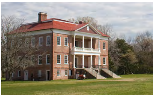
The aristocratic grounds of Drayton Hall