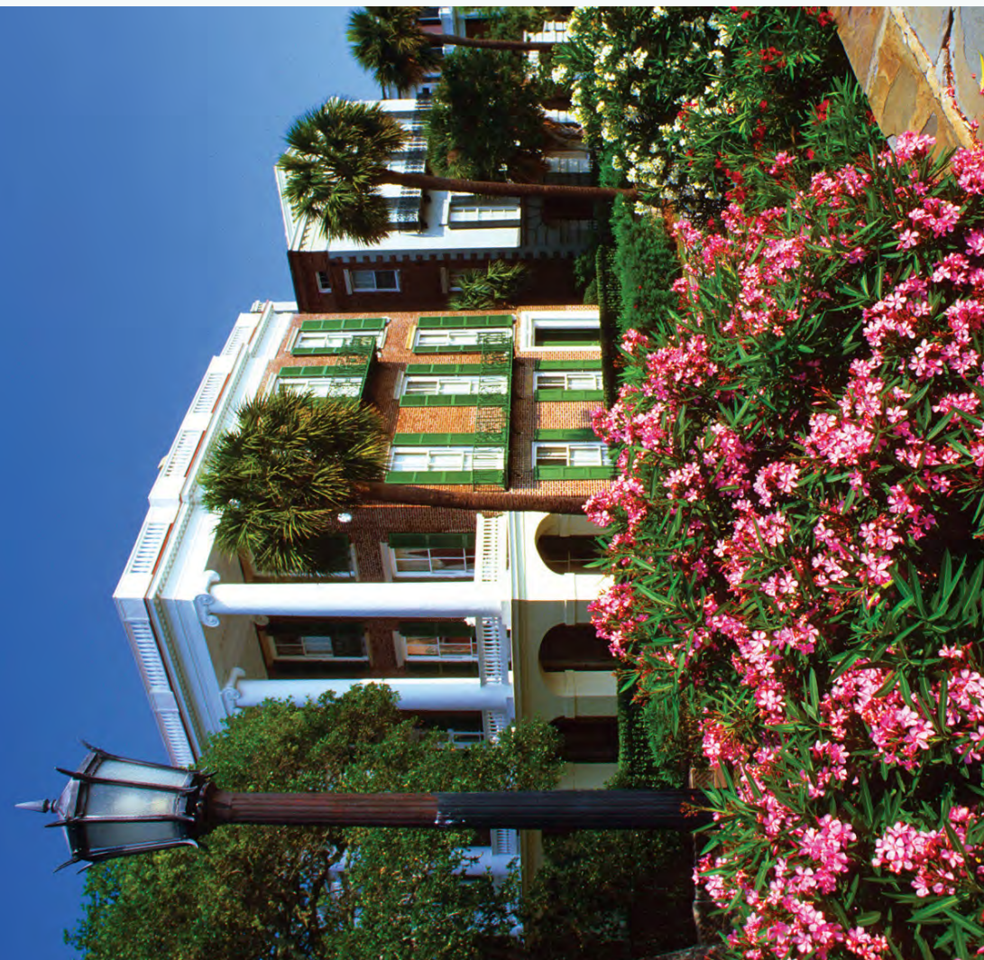
Classic Escapes protects our planet. ♻️