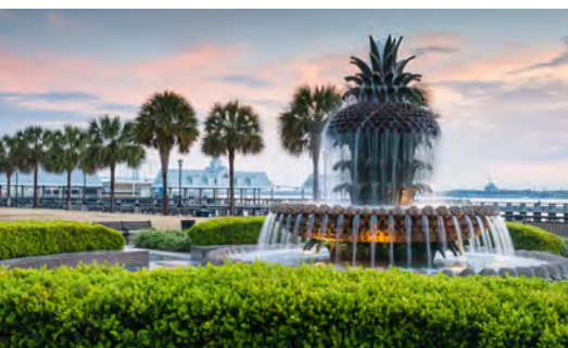
The famous Pineapple Fountain in Charleston Waterfront Park