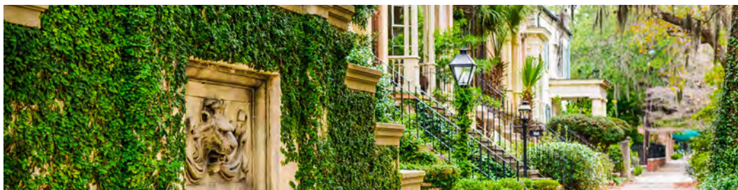
A picturesque, ivy-covered historic neighborhood in Charleston

performing arts venues and vibrant music scene. Here enjoy regional barbecue and fine craft beer. Visit the Biltmore mansion, Thomas Wolf Memorial, and the Basilica of St. Lawrence. End with a walking food tour of Asheville and discover incredible sights and tastes with Asheville's ultimate foodies!