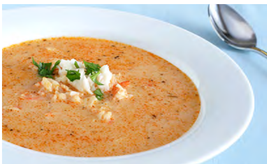
A hot bowl of traditional She Crab soup

"I'm going away...perhaps to Charleston, where there's a little bit of grace and charm left in the world..."