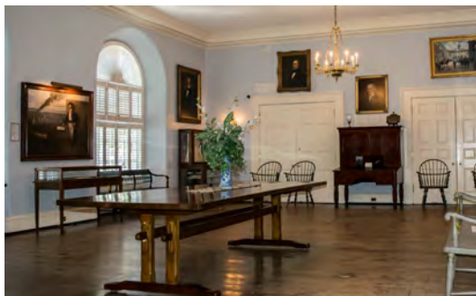
Lecture room at the Old Exchange Building in Charleston

Enjoy breakfast and then transfer to the airport for your flight home. Take with you the feeling of the moist Low Country air on your skin, the smell of moss and roses, and the salty wisps of sea fed breezes.