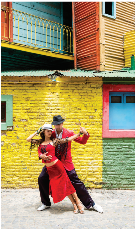
Tango in Buenos Aires’ La Boca