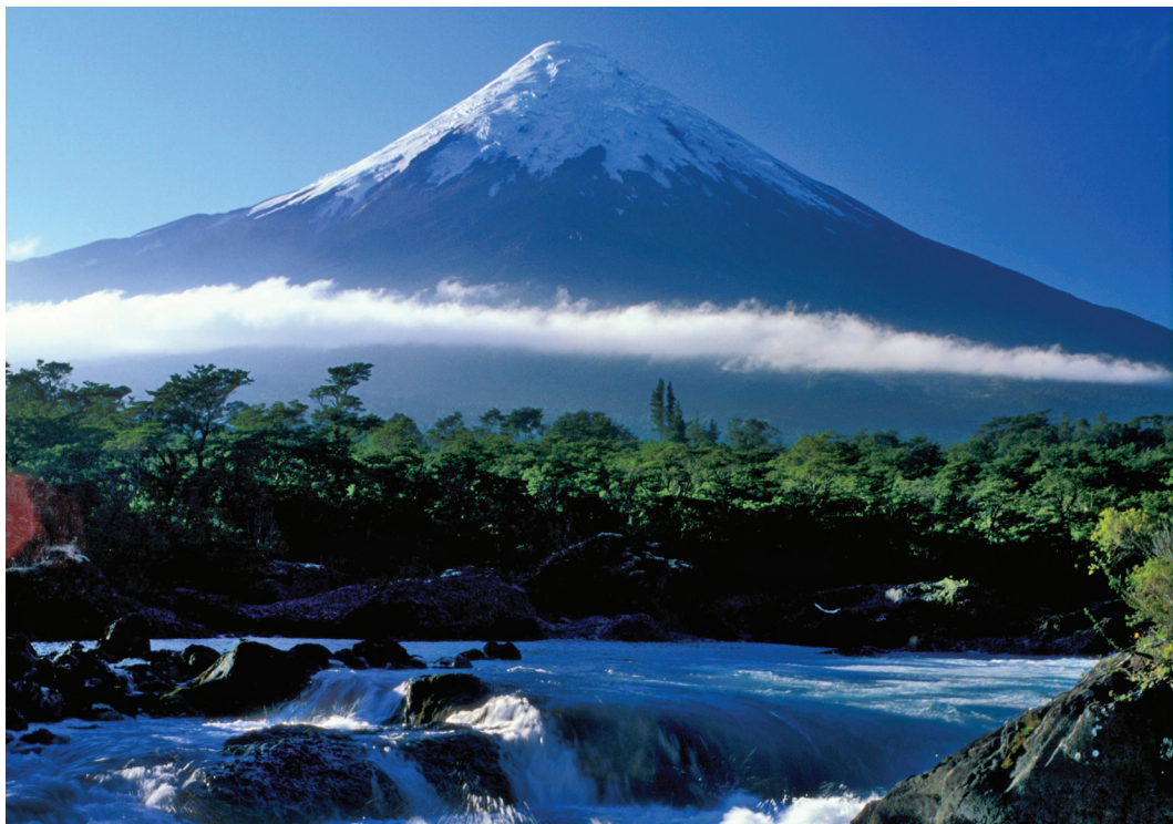
Chile's conical Osorno Volcano towers over the region.

Day 7: Vicente Rosales Park/Lake District Crossing/Peulla We depart this morning for Vicente Rosales, Chile's oldest national park, where we see Petrohue Waterfalls with snow-topped Osorno Volcano in the distance. Then we embark on the first leg of our Lake District crossing, boarding a catamaran for the ride across Lake Todos Los Santos, arriving 1½ hours later in Peulla. Here, amidst beautiful natural scenery of Andes peaks and dense forests, this afternoon we enjoy a 4x4 excursion. Then there's time before dinner at our hotel to engage in optional activities such as horseback riding, kayaking, and hiking. B,L,D