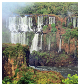
We tour dazzling Iguazu Falls on Day 14.

Day 15: Iguazu Falls/Rio de Janeiro, Brazil We cross the border this morning to see Iguazu from the Brazilian side, getting a different perspective as we take a guided walk along the river. Early this afternoon we transfer to the airport for the flight to vibrant Rio, the most visited city in the southern hemisphere. B,D