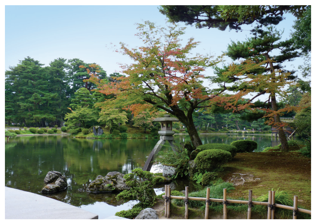
On Day 9 we visit Kenrokuen Garden, one of Japan's finest traditional gardens.

Day 6: Hakone/Takayama Today we travel first by bullet train then by Wide View Hida express train to lovely Takayama in the Japanese Alps, considered one of the country's most attractive towns with its 16<sup>th</sup>-century castle and old-style buildings. Our explorations center on three narrow streets in the San-machi-suji district where, in feudal times, merchants lived amidst the authentically preserved small inns, teahouses, and sake breweries. This afternoon we attend a traditional Japanese tea ceremony here, an historic ritual of form, grace, and spirituality. B,D