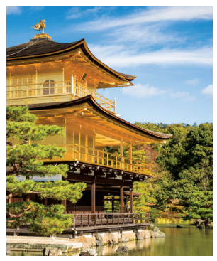
We visit Kyoto's beloved Golden Pavilion on Day 10.

Day 10: Kyoto We depart this morning by train for Kyoto, formerly Japan's Imperial Capital and now the country's cultural and artistic center, with more than 1,600 temples, hundreds of shrines, artful gardens, and historic architecture. Upon arrival, we visit Kinkakuji, the beloved lakeside Temple of the Golden Pavilion set on pillars suspended over the water. Next: Ryoanji, a Zen Buddhist temple whose acclaimed dry garden epitomizes the simplicity of Zen meditation. Our last stop is Unrakugama, a workshop specializing in prized Kiyomizu pottery. B , D