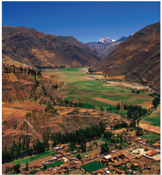
The beautiful and historic Sacred Valley