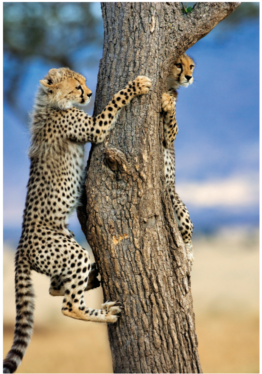
Cheetah cubs on the lookout in Masai Mara