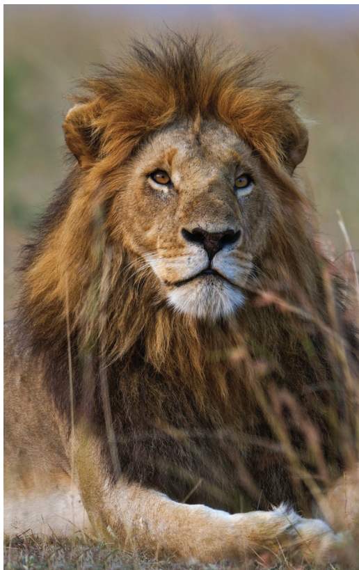
The lion king

Day 12: Serengeti/Masai Mara We leave Tanzania today, crossing into Kenya and continuing on to Masai Mara, Kenya's – and Africa's – premier wildlife reserve, rich with animal life and traditional homeland of the native Maasai people. Known especially for