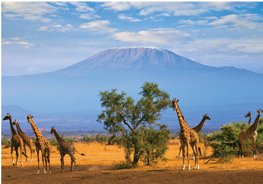
A tower of giraffe at Amboseli, in the shadow of Mt. Kilimanjaro

attracts herds of plains animals plus hippo, monkeys, and baboons. On today's two wildlife drives, we get another taste of this incredibly diverse landscape and wildlife. B,L,D