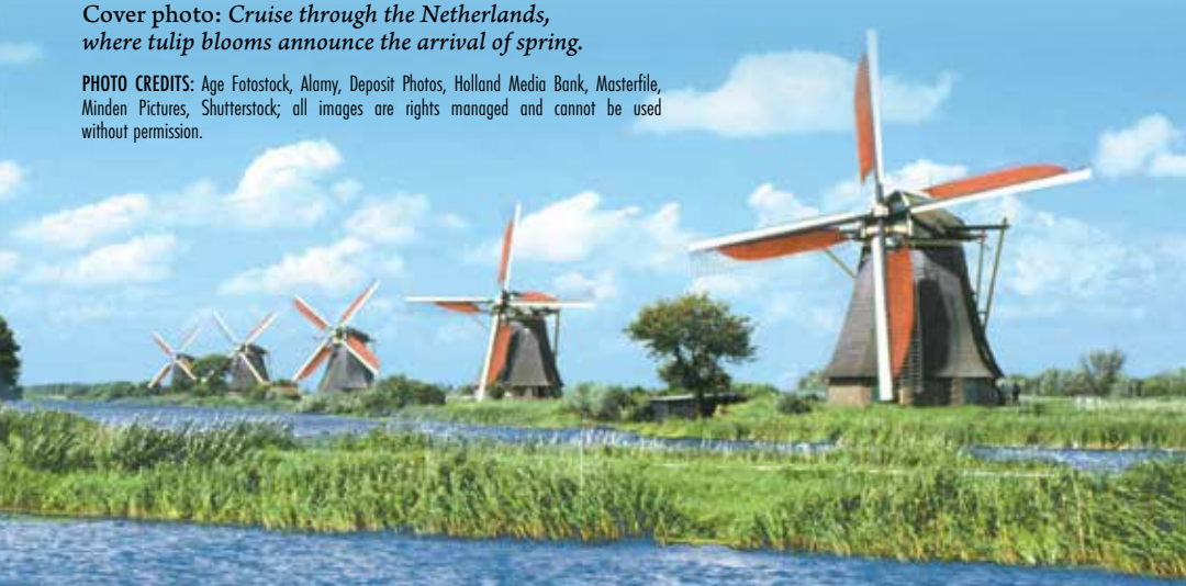
Photo below: See the Windmills at Kinderdijk, which once prevented flooding in the wetlands of Dordrecht.

The safety and well-being of our travelers remains our highest priority. All passengers traveling on our programs are required to present confirmation of a full COVID-19 vaccination, and, as well may have to produce evidence of a recent negative COVID test. All our staff are committed to adhering to all health and safety protocols from the start of your trip to the end as directed by the United States Center for Disease Control and Prevention, overseas health officials, as well as those protocols mandated by your cruise company (if applicable). Detailed protocol information tailored to your travel program will be mailed to you along with additional pre-departure information.