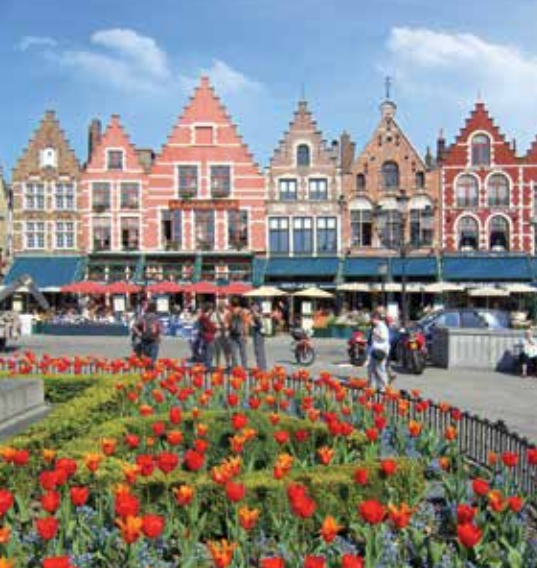
The lively, medieval Market Square is the principal city square and gathering point in Bruges.