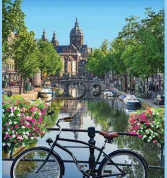
Amsterdam's bridges and canals bring the intimacy of a small town to one of Europe's most celebrated cities.