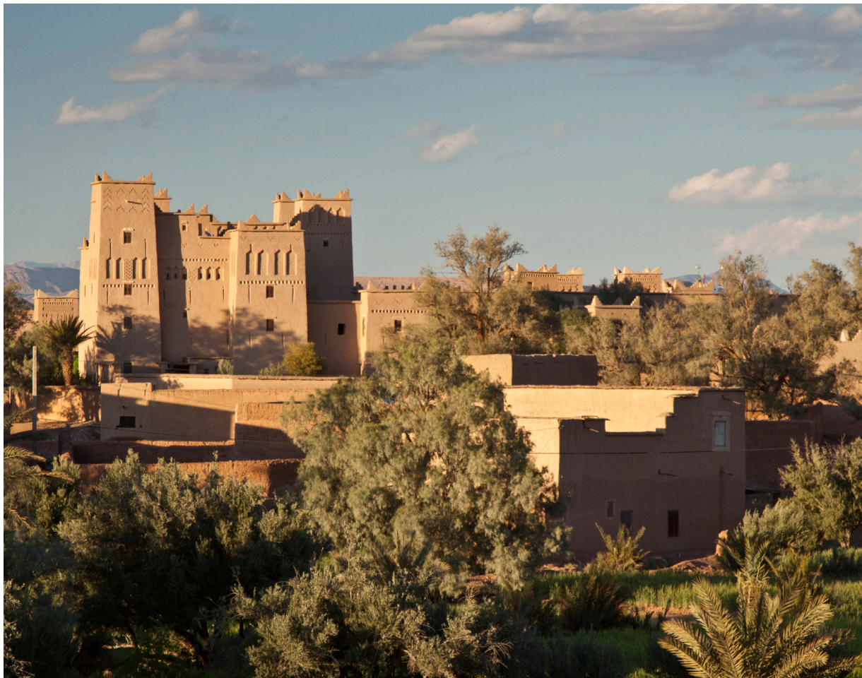
We encounter many of Morocco's age-old kasbahs on our journey.