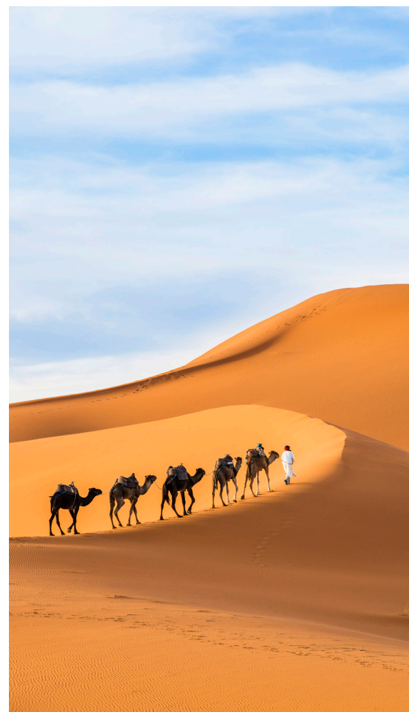
We ride camels in the Sahara on Day 8.

Day 14: Depart for U.S. After breakfast this morning we transfer to the airport for our return flight to the U.S. B