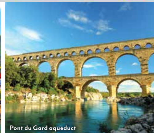
Pont du Gard aqueduct