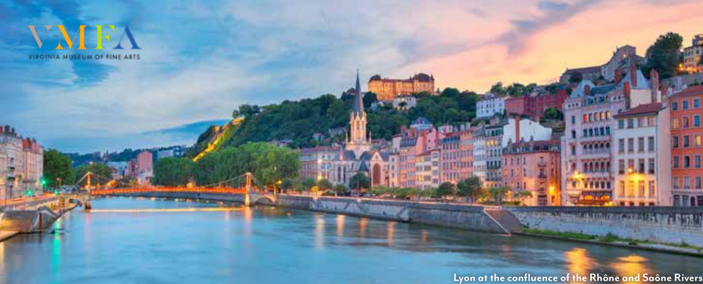
Lyon at the confluence of the Rhône and Saône Rivers