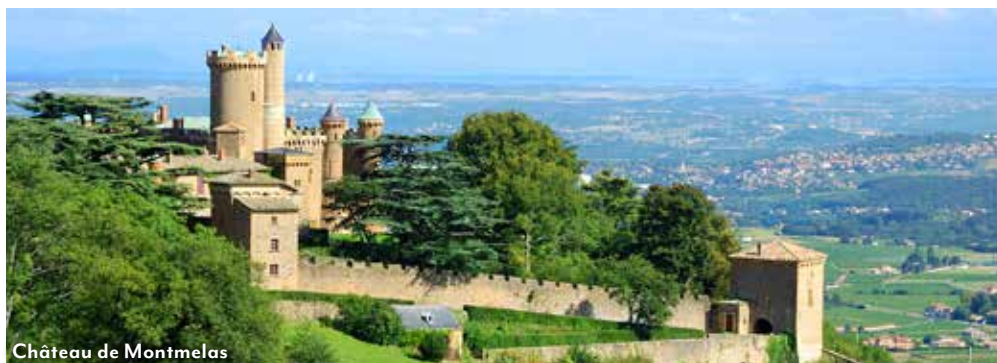
Château de Montmelas