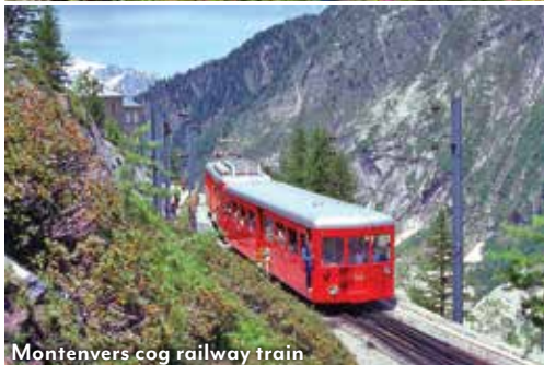
Montenvers cog railway train

Begin your French adventure with four days touring the world-class city of Geneva, Switzerland. Delight in the mountainous beauty of the Savoie Mont-Blanc region at the convergence of France, Switzerland and Italy. Enjoy a private tour of the Red Cross Museum and the Patek Philippe Watch Museum. Explore the French village of Chamonix, the historic capital of Alpine skiing and host of the first Winter Olympic Games in 1924. Board the famous Montenvers cog railway train to the legendary Mer de Glace, the largest glacier in France and its La Grotte. Enjoy a visit to Annecy, the "Venice of the Alps," for a guided walking tour. Accommodations are for three nights in the elegant HÔTEL BRISTOL GENÈVE, located in the heart of the city.