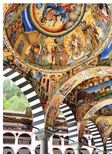
Frescoes at Rila Monastery

Day 11: Bucharest Today we encounter two vibrant vestiges of Bucharest's once-thriving Jewish community: