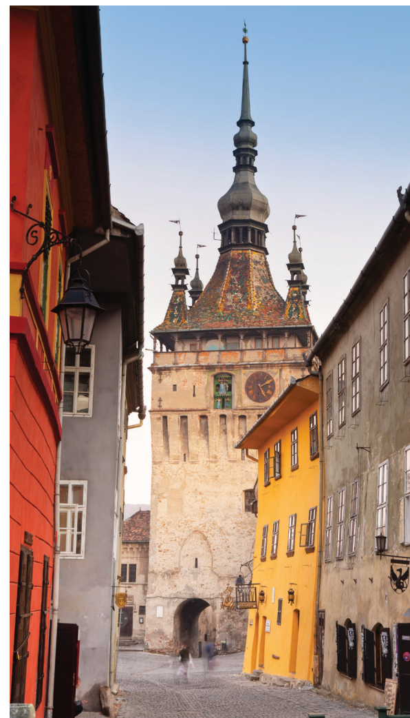
Sighisoara's medieval Old Town and clock tower

Day 17: Depart for U.S. We transfer to the Bucharest airport for our return flights to the U.S. B