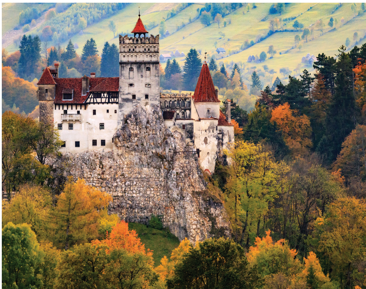
On Day 15, we tour 14 th -century Bran Castle, believed to be the inspiration for the home of Bram Stoker's Count Dracula.