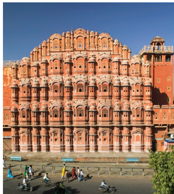
We see the “Palace of the Winds” in Jaipur on Day 6.

Day 15: Varanasi Early this morning we return to the Ganges where Hindu pilgrims perform their rituals along the ghats (steps) leading to the river. We visit several ghats by boat as we experience for ourselves the spiritual aura of the hallowed Ganges waters. Then we return to our hotel with time to rest before this afternoon’s walking tour and private performance of classical sitar. Tonight we celebrate our journey at a farewell dinner at our hotel. B,D