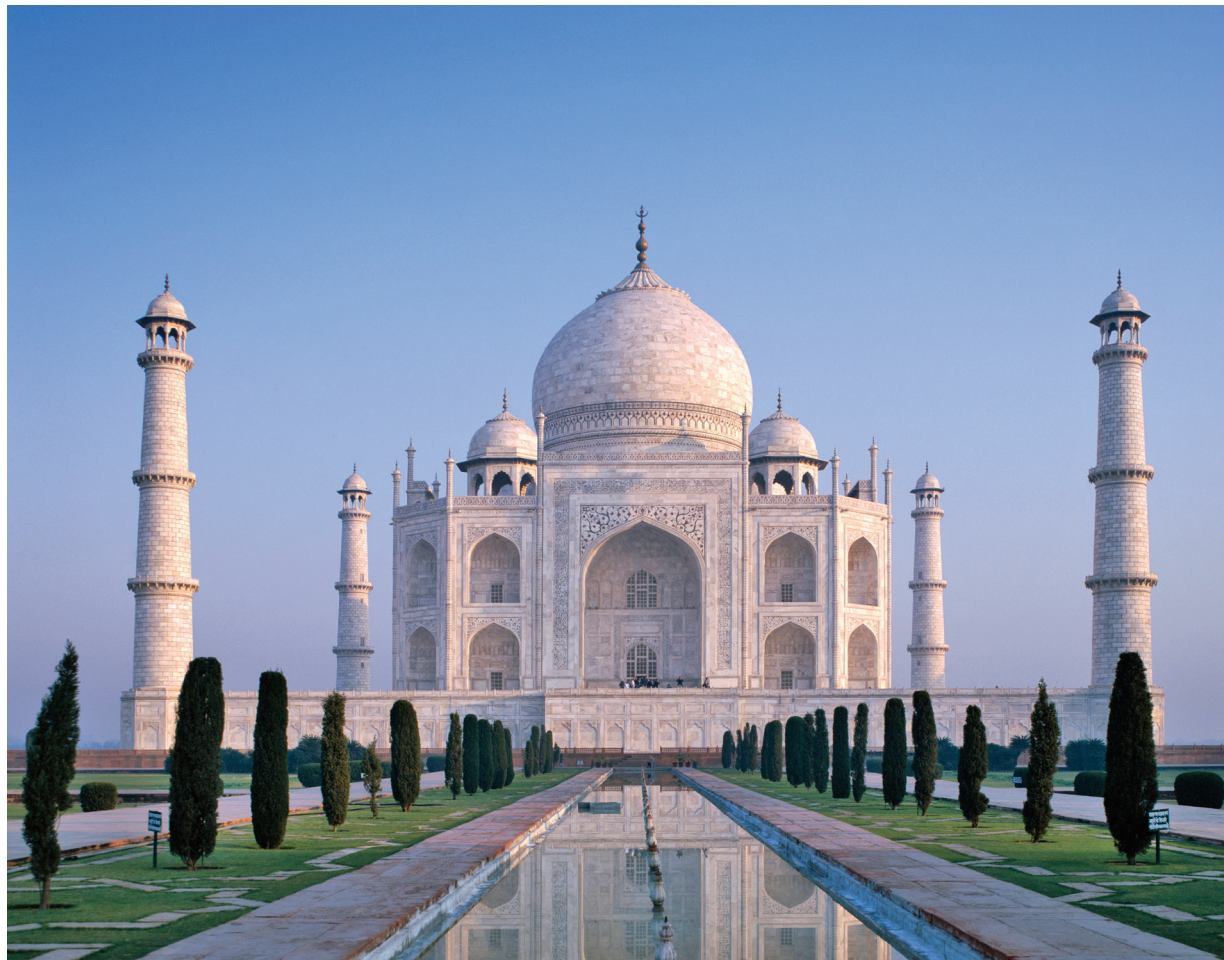
On Day 12 we visit the Taj Mahal, a UNESCO site considered one of the world's most beautiful buildings.