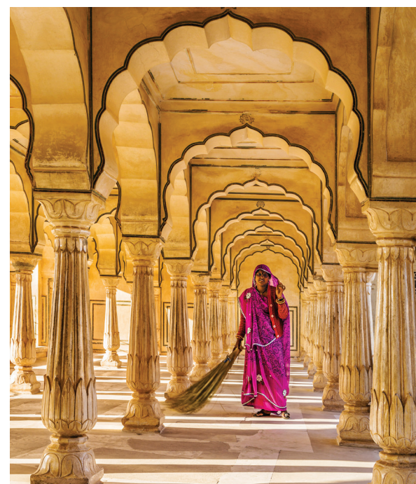
We explore Jaipur’s Amber Fort on Day 6.

Day 16: Varanasi/Delhi We fly this afternoon to Delhi, where the evening is at leisure. B