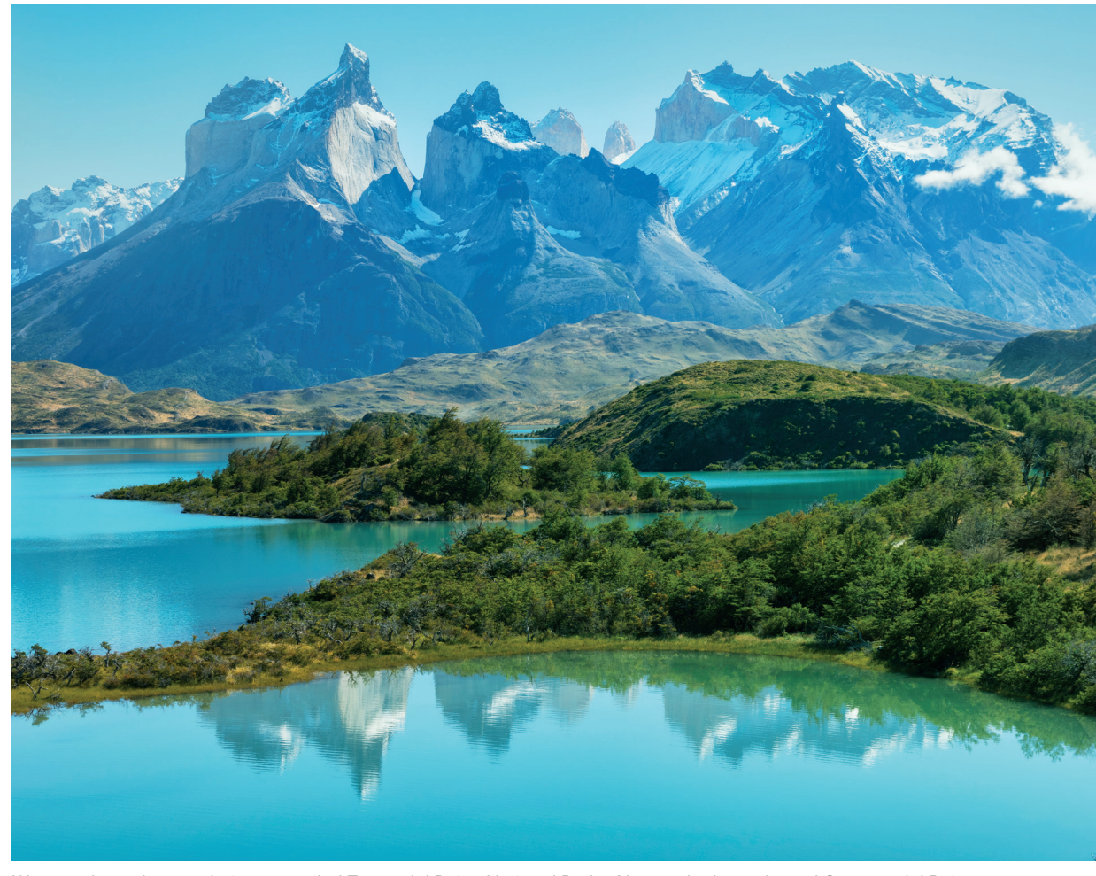
We spend two days exploring unspoiled Torres del Paine National Park. Above: the horn-shaped Cuernos del Paine.