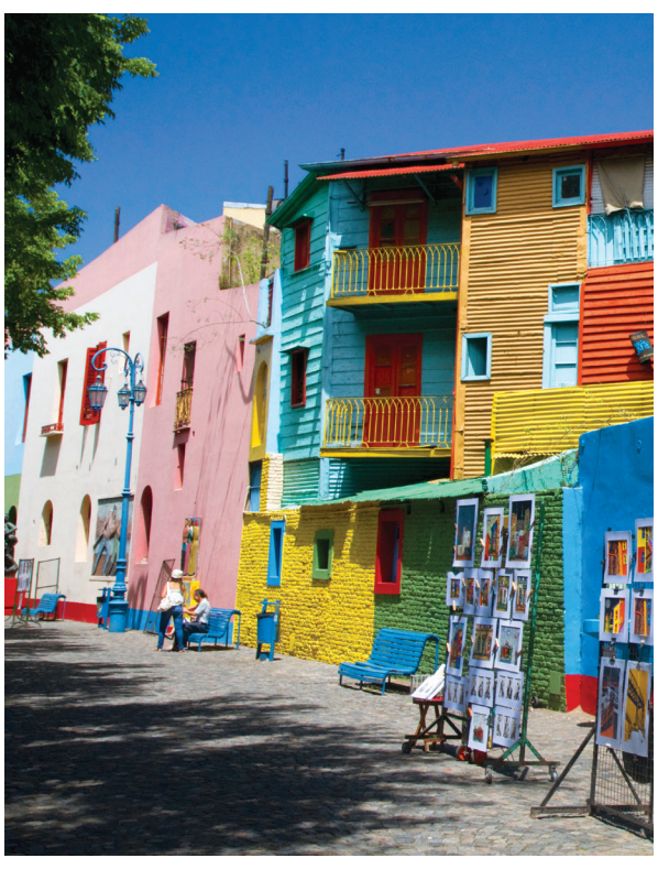
We visit Buenos Aires' colorful La Boca district on Day 3.