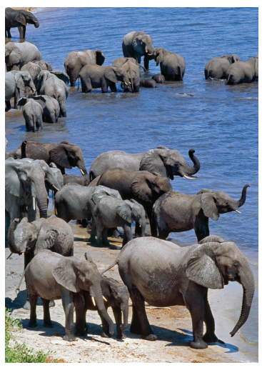
Elephants abound at Chobe.

Day 11: Sossusvlei/Swakopmund We travel today through the Namib desert en route to Swakopmund, Namibia's largest port. B,L,D