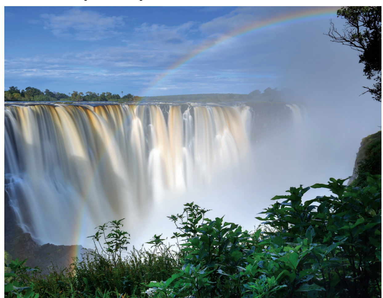
Spanning the width of the Zambezi River, Victoria Falls is the world's largest waterfall.