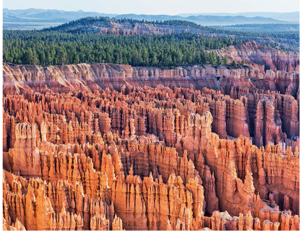
Bryce Canyon boasts the world's largest concentration of "hoodoos," the irregular rock formations seen above.

Ratings are based on the Hotel & Travel Index, the travel industry standard reference.