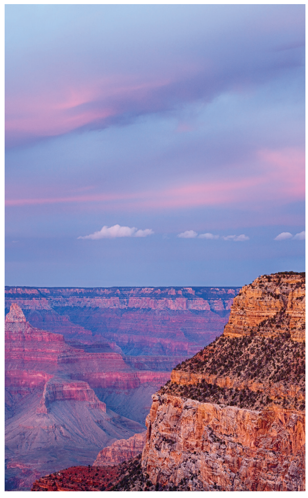
The magnificent Grand Canyon