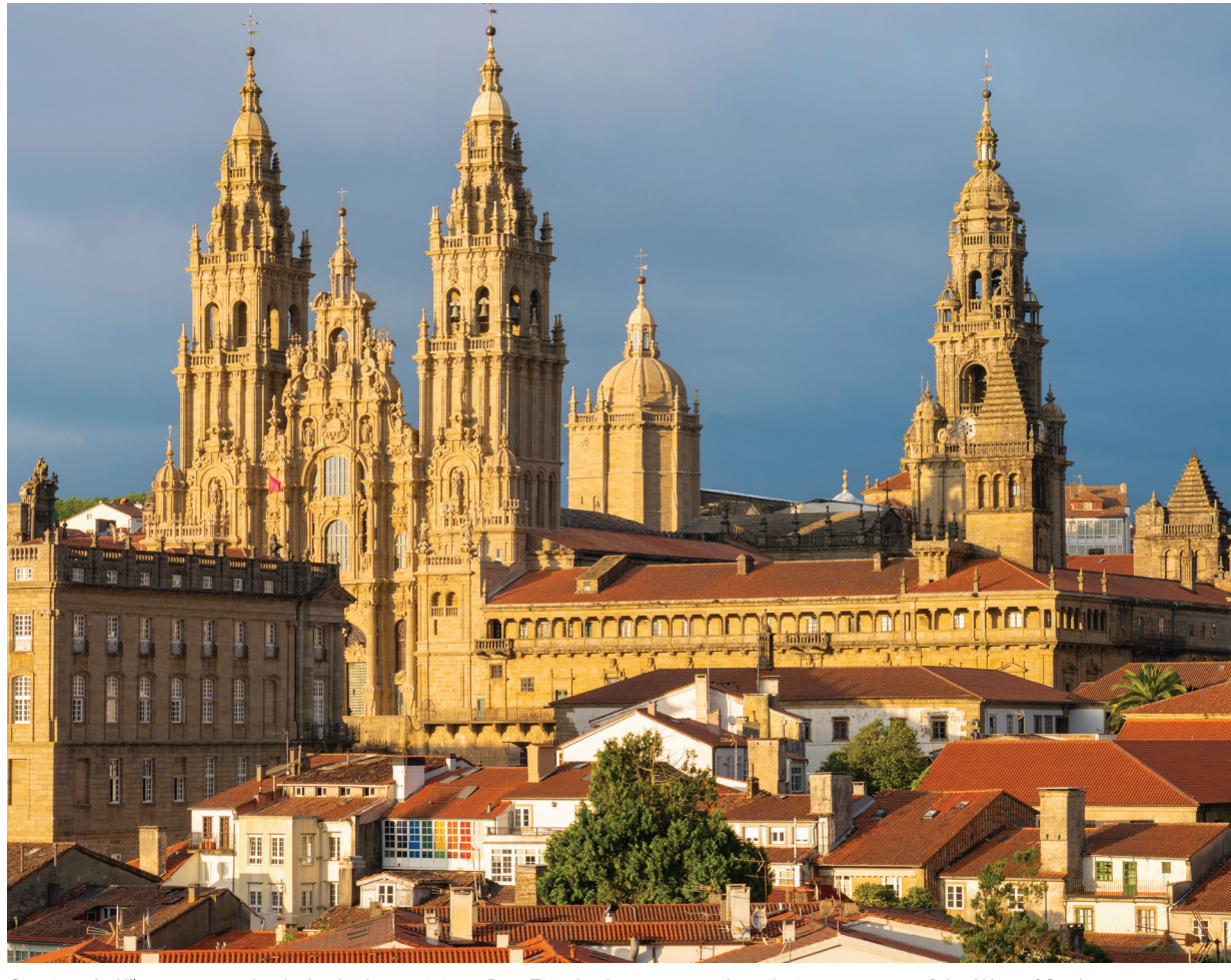
Santiago's 11th-century cathedral, which we visit on Day 7, is the last stop on the pilgrimage route of the Way of St. James.