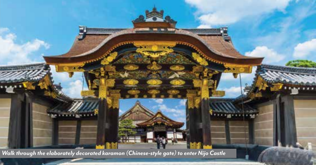
Walk through the elaborately decorated karamon (Chinese-style gate) to enter Nijo Castle