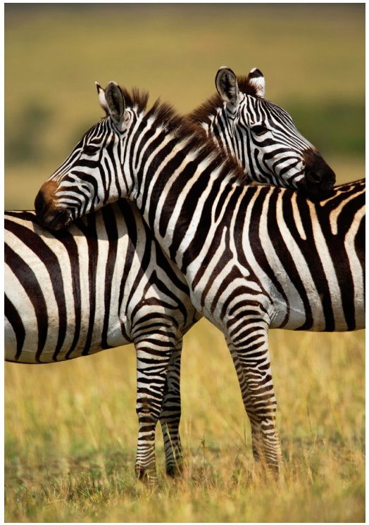
We’re sure to see zebra.

Day 16: Arrive U.S. We reach the U.S. today and connect with our flights home.