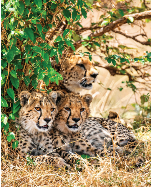
Cheetahs in Masai Mara