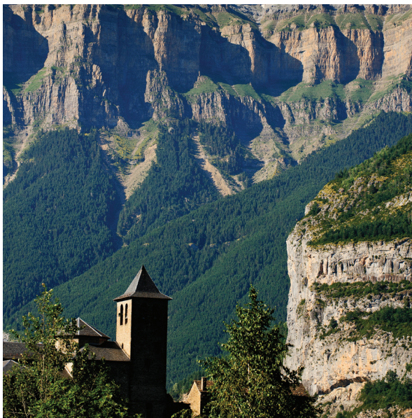
We spend two nights in the Pyrenees.

Day 11: Bilbao/Basque Country A day-long excursion begins with a poignant stop: Gernika (Guernica),