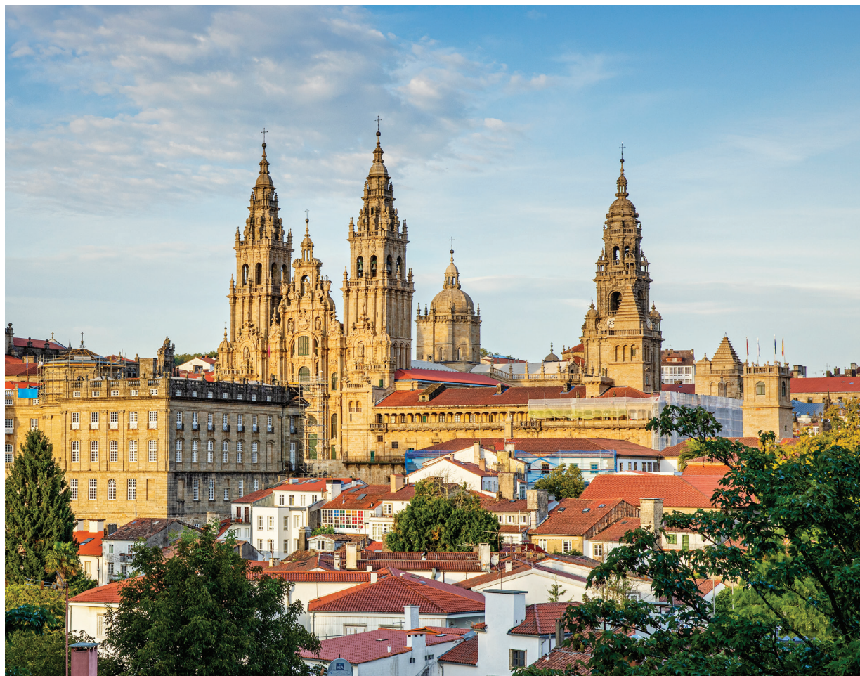
Santiago's 11 th -century cathedral, which we visit on Day 7, is the last stop on the pilgrimage route of the Way of St. James.