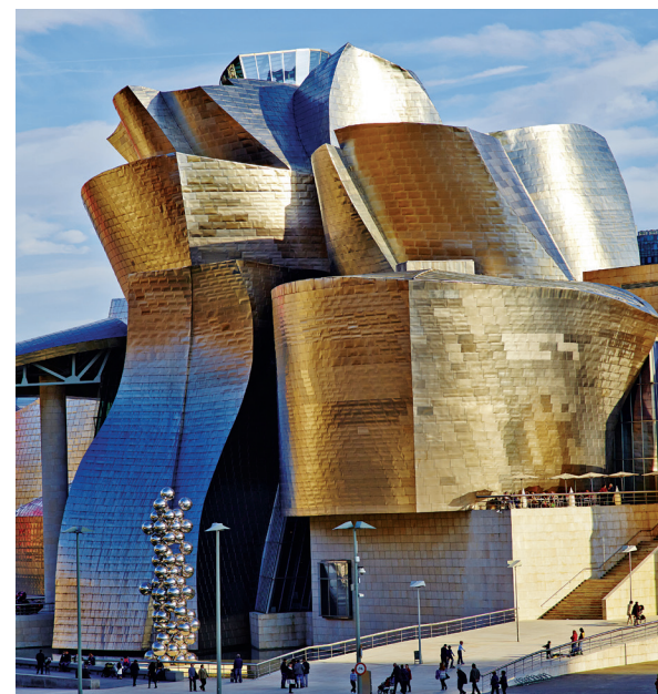
Bilbao's iconic Guggenheim Museum

Now housing a cultural center, Casa Mila is a UNESCO site. This afternoon is at leisure; tonight we bid ¡adios! to Spain, and to our fellow travelers, at a farewell dinner. B,D