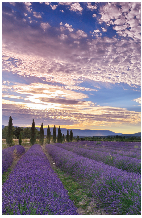
Fragrant fields of lavender mark Provence.