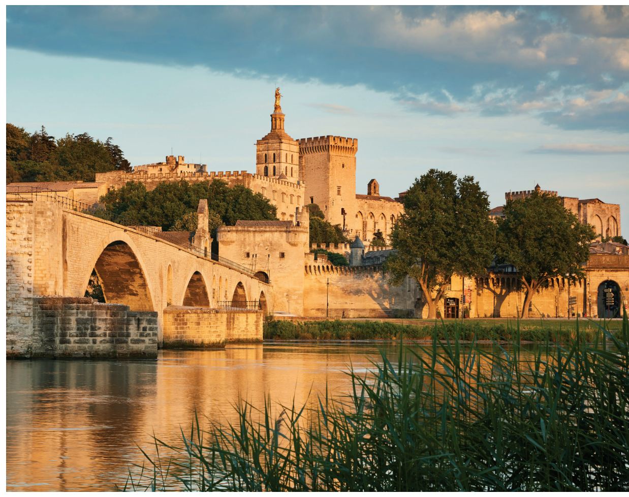
We tour the Palais des Papes, one of Europe's most important medieval structures, on Day 6.

Ratings are based on the Hotel & Travel Index, the travel industry standard reference.