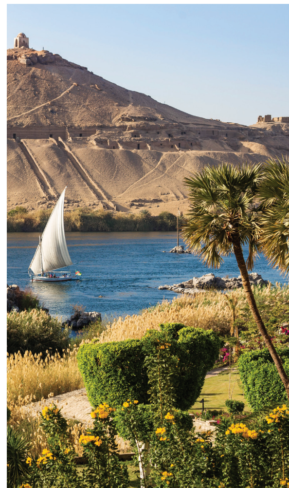
We sail traditional feluccas along the Nile.