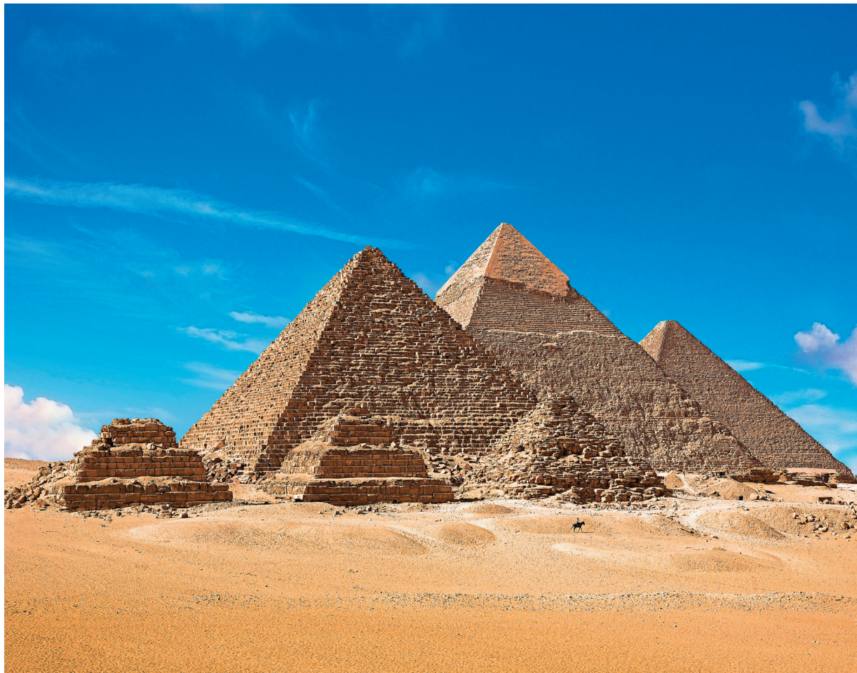
On Day 4 we travel to the Giza plateau to see the legendary pyramids, built 5,000 years ago as royal tombs.