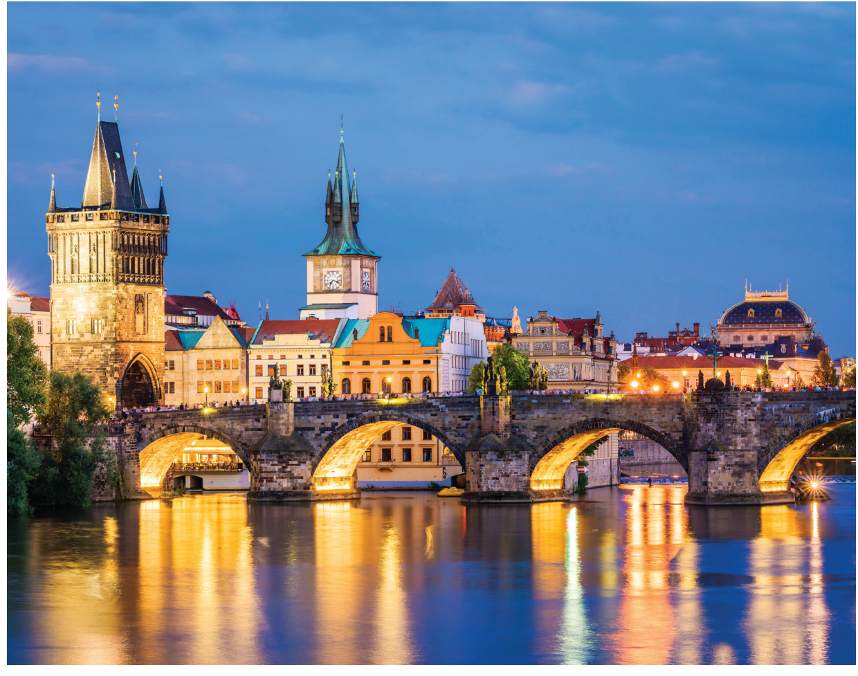
Nighttime view of Prague's Charles Bridge, which connects Old Town with Prague Castle

Ratings are based on the Hotel & Travel Index, the travel industry standard reference. Unrated hotels may be too small, too new, or too remote to be listed.