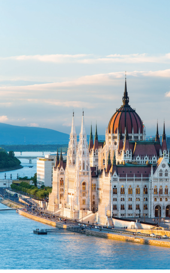
Budapest's Gothic Parliament sits on the Danube.