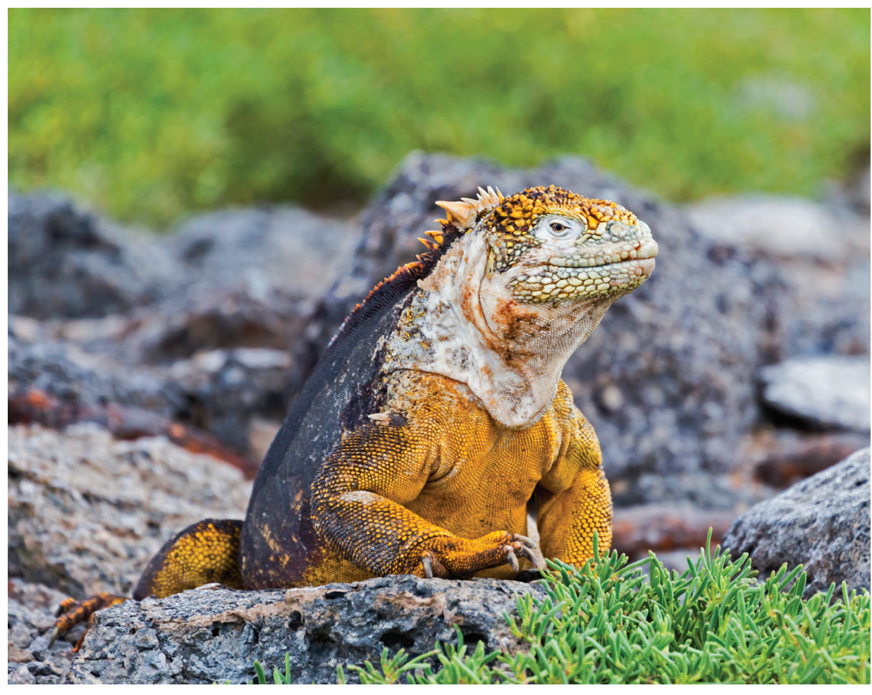
We'll encounter plenty of wildlife in the Galapagos, including relatives of this land iguana.

Ratings are based on the Hotel & Travel Index, the travel industry standard reference.