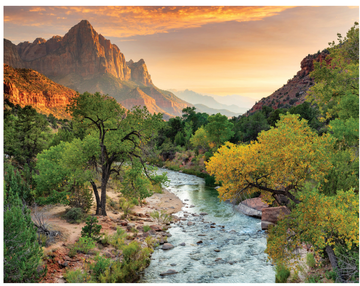
Zion NP's 232 square miles boast a diversity of landscapes, including high plateaus, deep sandstone canyons, and the Virgin River.

Ratings are based on the Hotel & Travel Index, the travel industry standard reference.