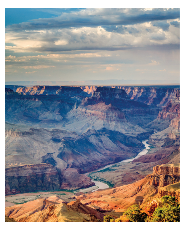
The Colorado and the Grand Canyon

Day 5: Grand Canyon/Page/Antelope Canyon/ Lake Powell Today we travel to Page, Arizona, gateway to the imposing Glen Canyon Dam and its reservoir, Lake Powell. After reaching Page early this afternoon, we have lunch on our own then visit the sinuous – and spectacular – Upper Antelope Canyon. We travel onto Navajo land to reach this slot canyon, known to local tribes as "the place where water runs through rocks" - and one of the most photographed slot canyons in the world. Our tour through this stunning passageway reveals red-orange walls of "flowing" rock rising to heights of nearly 120 feet - the narrow canyon's hard edges smoothed away by eons of water and sand erosion. We check in at our lakeside hotel this afternoon then enjoy dinner together there tonight. B,D