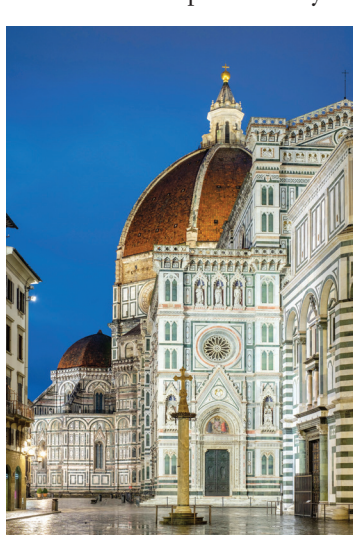
Florence's Duomo and Baptistry

Day 10: Radda-in-Chianti/Siena Today we visit the walled city of Siena, whose historic center is a UNESCO site and whose ochre-colored buildings and ancient ramparts vividly evoke its medieval