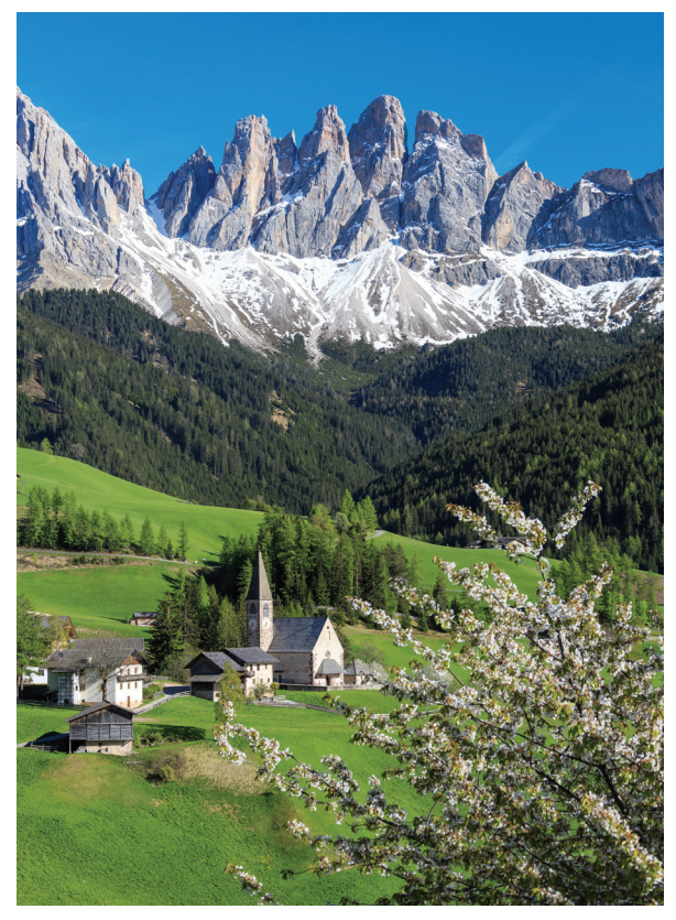
We enjoy stunning Dolomites scenery in the South Tyrol.

Day 15: Depart for U.S. We depart early this morning for our connecting flights to the U.S. B