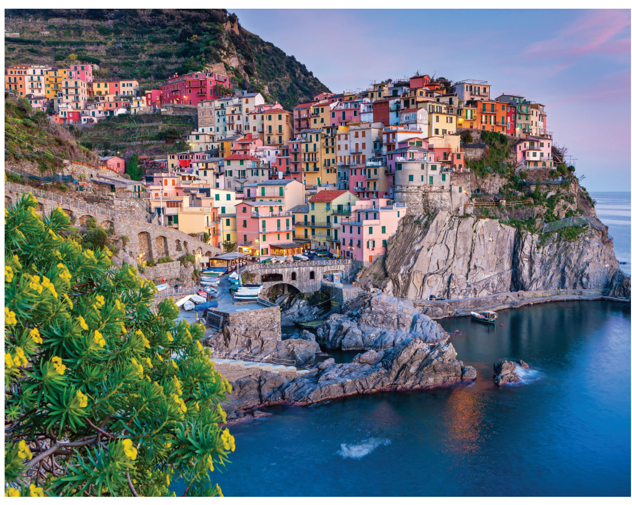
We see Liguria's Cinque Terre, a UNESCO site, by land and sea on Day 7.

Ratings are based on the Hotel & Travel Index, the travel industry standard reference.