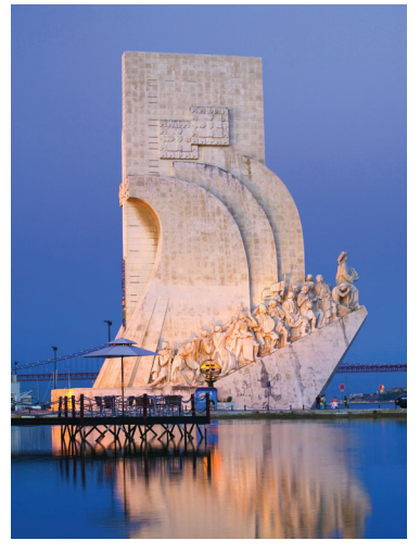
Lisbon's Monument to the Discoveries

the former stronghold of Moorish Spain set in the foothills of the snowcapped Sierra Nevada. The city's undisputed highlight is the Alhambra, the extraordinary palace of Spain's last Moorish rulers. Sprawled