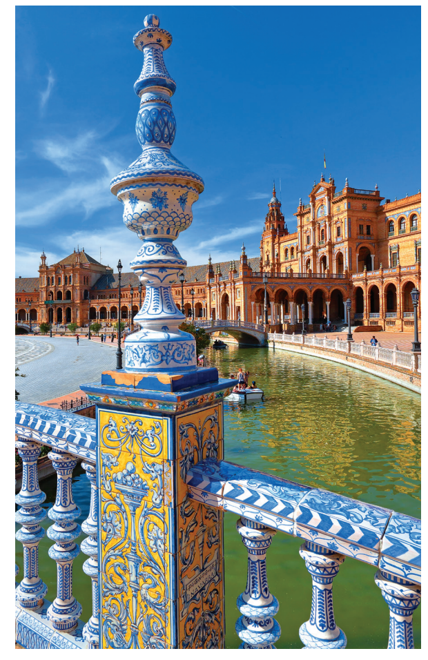
Seville's colorful Plaza de España