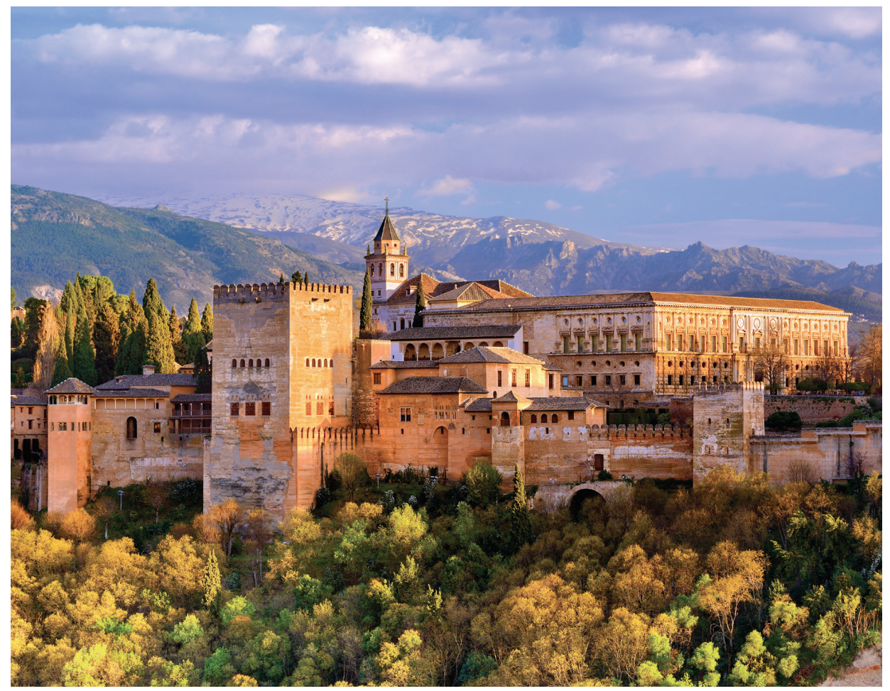
We spend the afternoon of Day 11 exploring the Alhambra, considered a pinnacle of Islamic architecture.

Ratings are based on the Hotel & Travel Index, the travel industry standard reference.