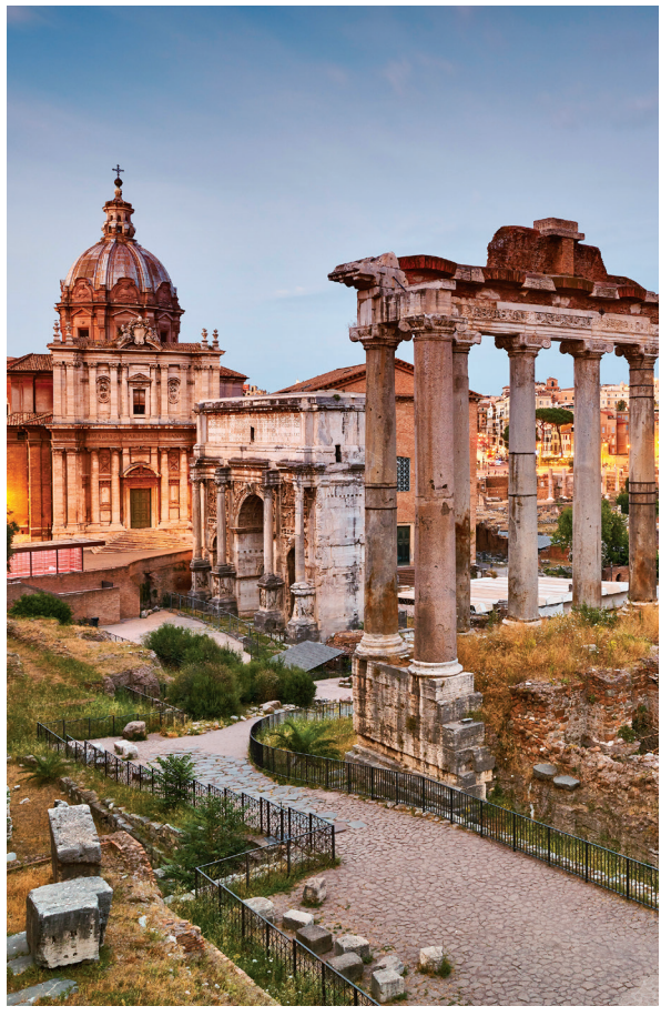
The Roman Forum dates to the 7th century BCE.