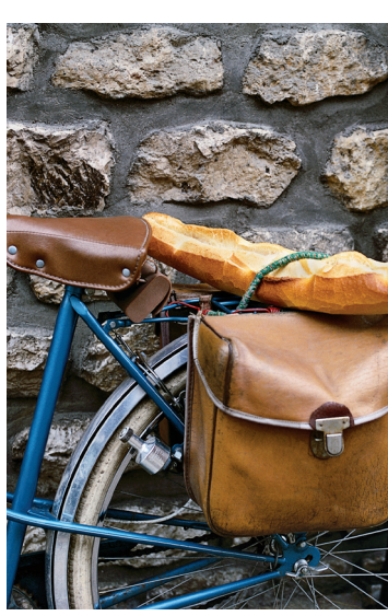
Typical French scene

Day 10: Saumur/Mont-St-Michel/Crépon Traveling north this morn-ing, we stop at Mont-St-Michel, Normandy's famed Gothic abbey that sits atop a 264-