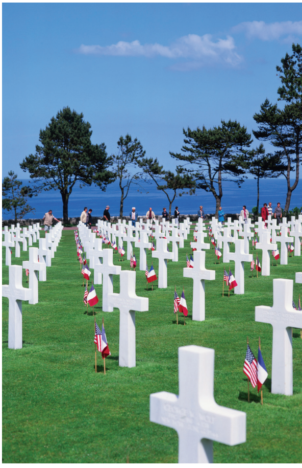
On Day 12, we visit the American Cemetery at Omaha Beach.