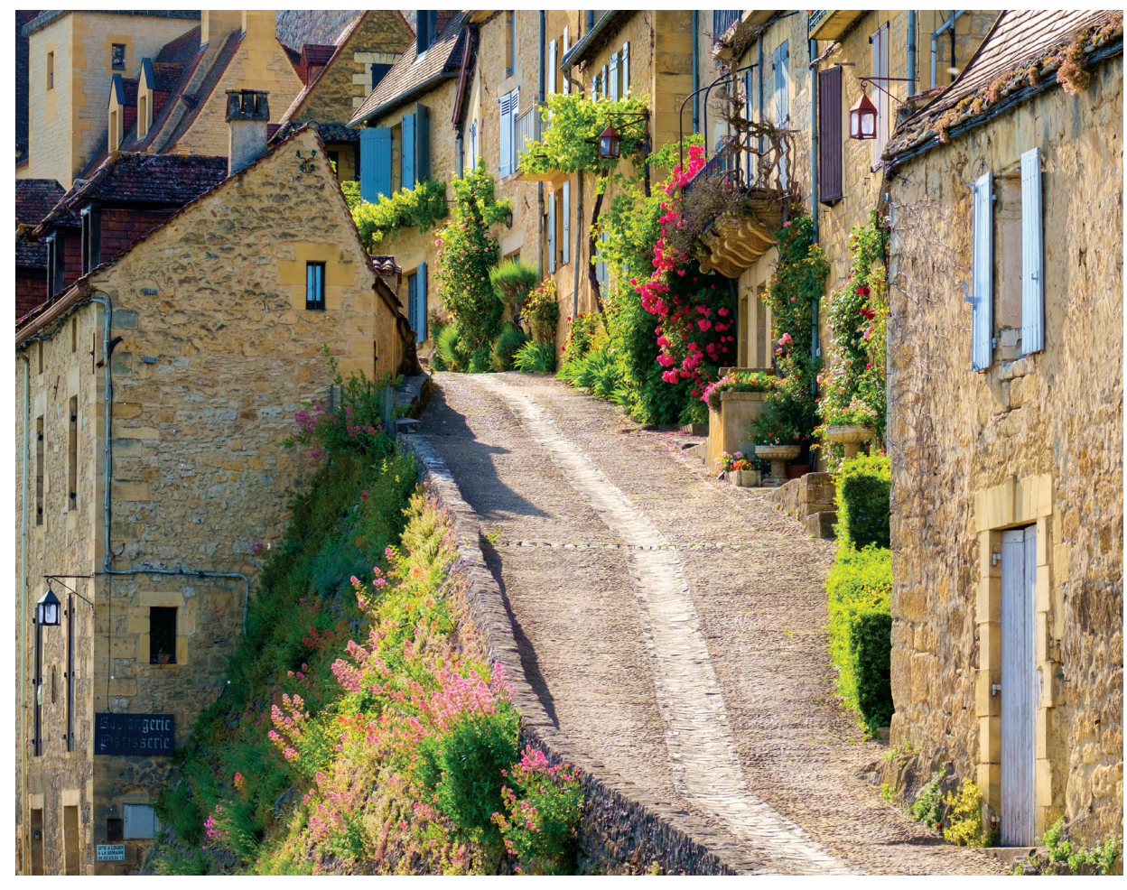
Street scene in the rural Dordogne region, with its villages, castles, and limestone cliffs

Ratings are based on the Hotel & Travel Index, the travel industry standard reference. Unrated hotels may be too small, too new, or too remote to be listed.