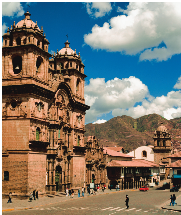
Plaza de Armas, Cuzco

Day 7: Cuzco After a morning at leisure, we set out on a tour of the archaeological hub of the Americas, the continent’s oldest continuously inhabited city, and UNESCO World Heritage site. Dynamic and historic, Cuzco is rich with the legacies of its Inca