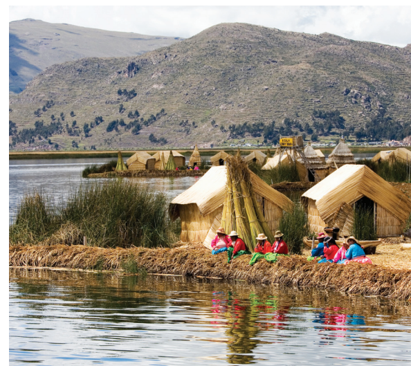
Local women gather on Uros Island

transfer to the airport for the flight to Lima, where we check into our day rooms at an airport hotel. Late this evening we depart on our flight to the U.S. B,L