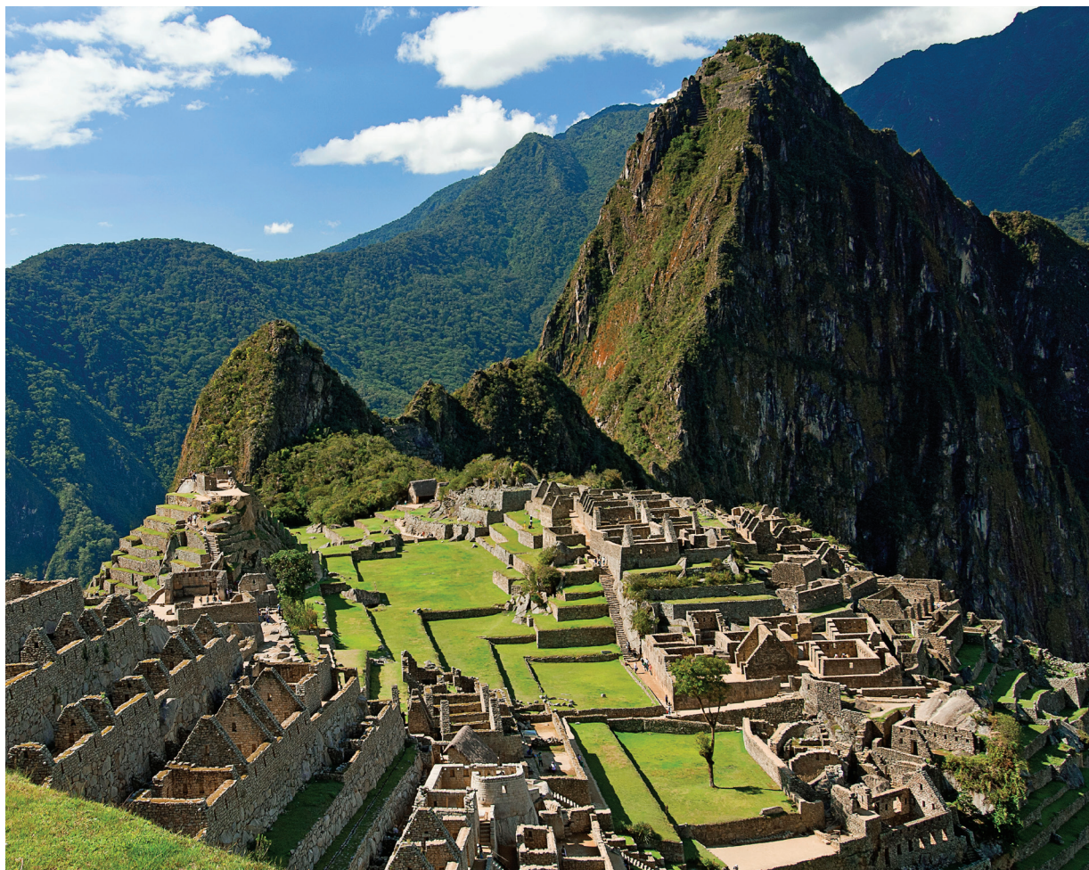
Just 50 miles from Cuzco, Machu Picchu (ca. 1450) was unknown to the outside world until its rediscovery by Hiram Bingham in 1911.