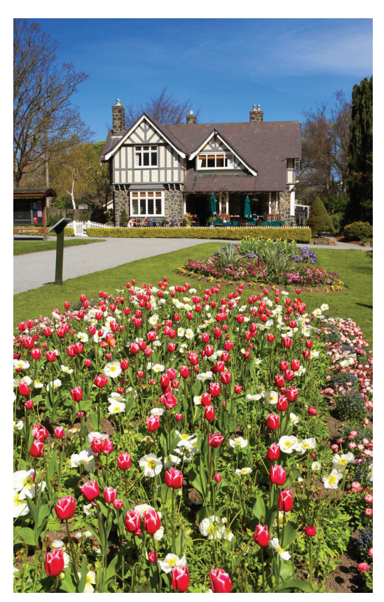
We tour Christchurch's Botanic Gardens on Day 10.