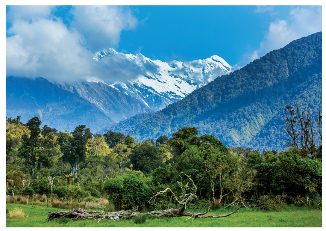
We spend two nights near splendid Westland Tai Poutini National Park.

Reaching Napier after lunch, we embark on a guided walking tour of the city's 1930s Art Deco architecture. After an earthquake leveled the city in 1931, it was rebuilt in "Deco" style; today, Napier ranks as one of the most authentically Art Deco cities in the world. Dinner tonight is on our own. B , L