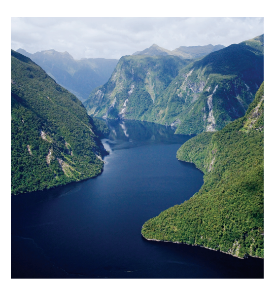
We cruise Doubtful Sound on Day 14.

Day 16: Depart for U.S. We depart this morning for the airport and our return flights home. B