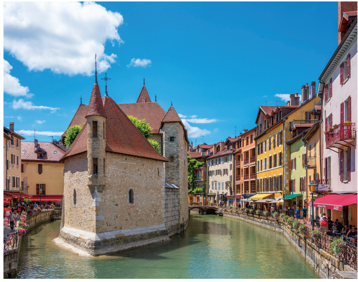
We visit canal-laced Annecy, the "Venice of the Alps," on Day 9.