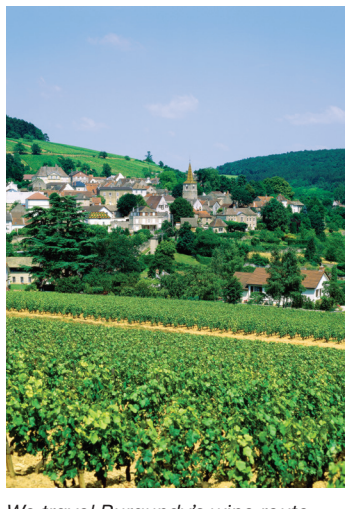
We travel Burgundy's wine route.

Day 9: Lyon/Annecy We set out today for the French Alpine town of Annecy on the shores of its namesake lake. Streetside canals and the Thiou River run through the picturesque Old Town, which we discover on a walking tour along the narrow lanes flanked by pastel-colored houses. We visit the town's vibrant market then enjoy a cruise on Lake Annecy, fed by the pristine waters of the surrounding Alps. B