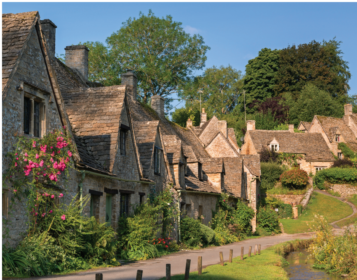
Gentle rolling hills, stone walls, and picturesque towns and villages mark the Cotswolds, where we travel on Day 10.

Ratings are based on the Hotel & Travel Index, the travel industry standard reference.