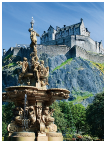
Scotland’s Edinburgh Castle

Day 10: Stratford-upon-Avon/The Cotswolds/Bath Today we encounter the Cotswolds, England’s south central region of gently rolling hills dotted with