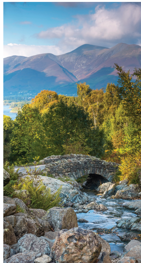
Bucolic scene in England’s Lake District