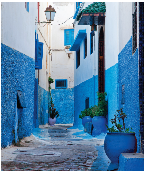
Rabat's Kasbah des Oudaias

Day 10: Ouarzazate/Ait ben-Haddou/Marrakech En route to Marrakech today, we stop first at uninhabited Ait ben-Haddou, a UNESCO World Heritage site and one of southern Morocco's most scenic villages that is often used as a location for fashion and film