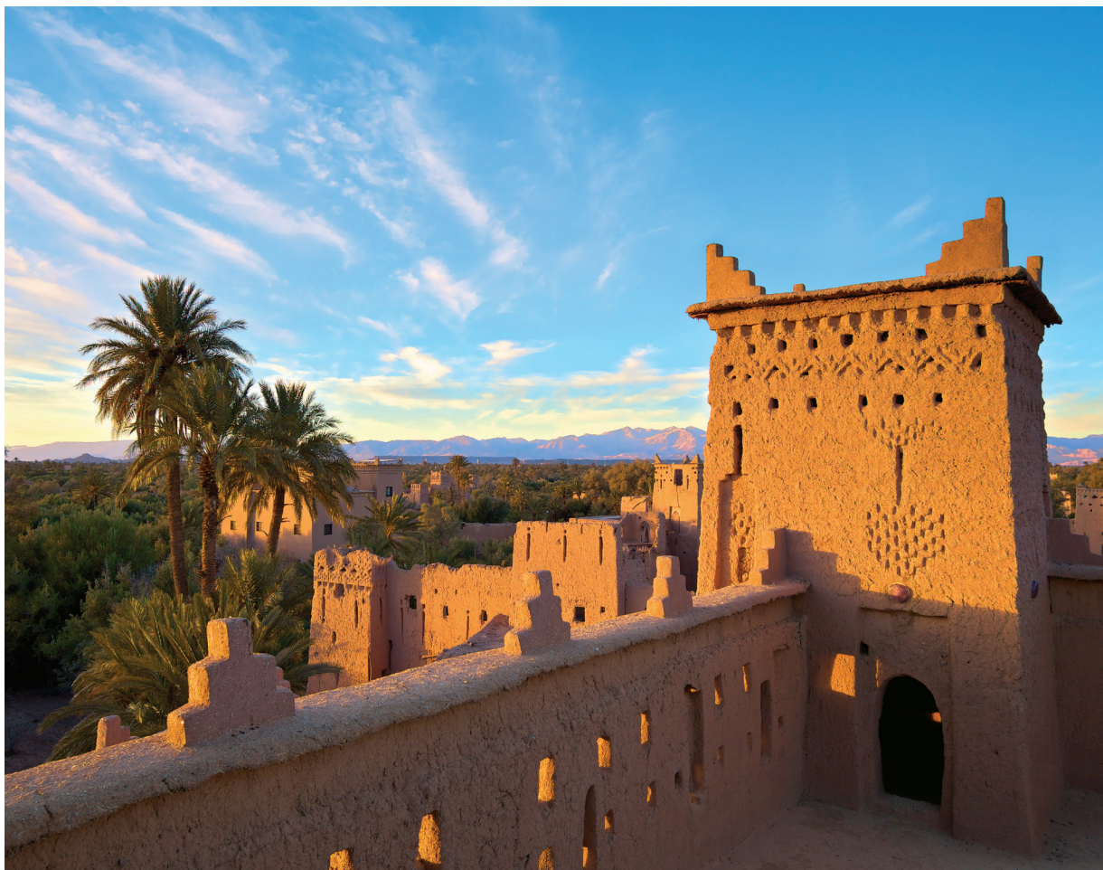
We travel the “Route of a Thousand Kasbahs” ancient caravan trail during our journey.

Ratings are based on the Hotel & Travel Index, the travel industry standard reference.