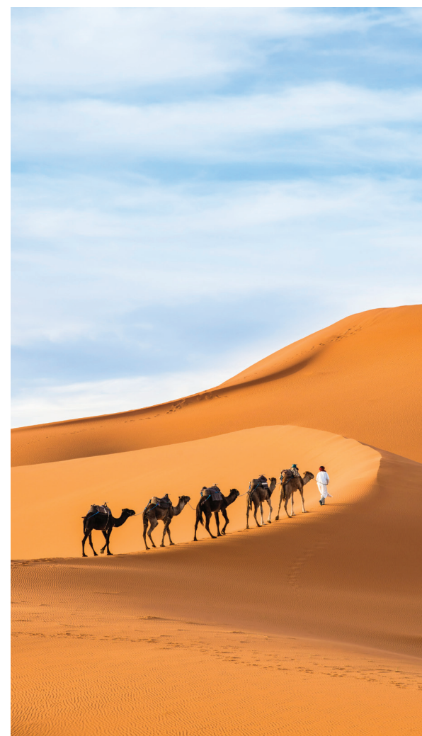
We ride camels in the Sahara on Day 8.