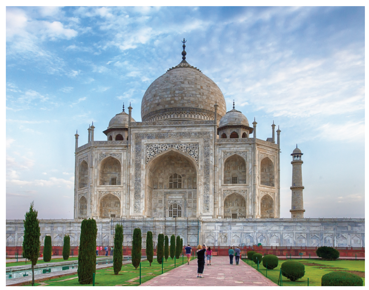
On Day 12 we visit the Taj Mahal, a UNESCO site considered one of the world's most beautiful buildings.

Ratings are based on the Hotel & Travel Index, the travel industry standard reference. Unrated hotels may be too small, too new, or too remote to be listed.