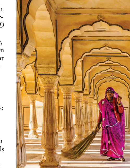
We explore Jaipur's Amber Fort on Day 6.

Day 16: Varanasi/Delhi We fly this afternoon to Delhi, where the evening is at leisure. B