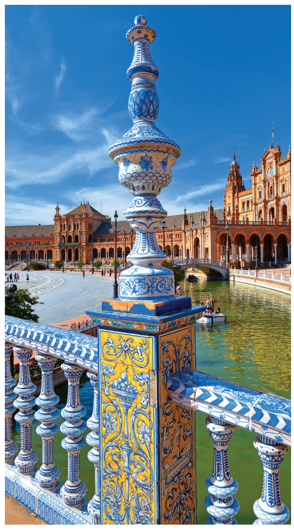
Seville's colorful Plaza de España