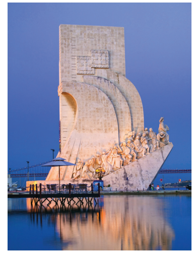
Lisbon's Monument to the Discoveries

Day 9: Carmona/Ronda Leaving Carmona this morning we travel south to tiny Ronda, one of Spain's oldest and most aristocratic towns. It's set high in the mountains with whitewashed houses clinging improbably to the edge of El Tajo Gorge – 500 feet deep and 300 feet wide. B , D