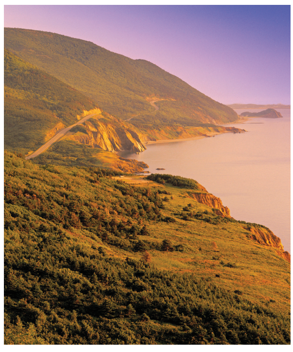
On Day 9, we travel the dramatic Cabot Trail.

town, where we have free time to explore as we wish followed by dinner at at local restaurant. B , D