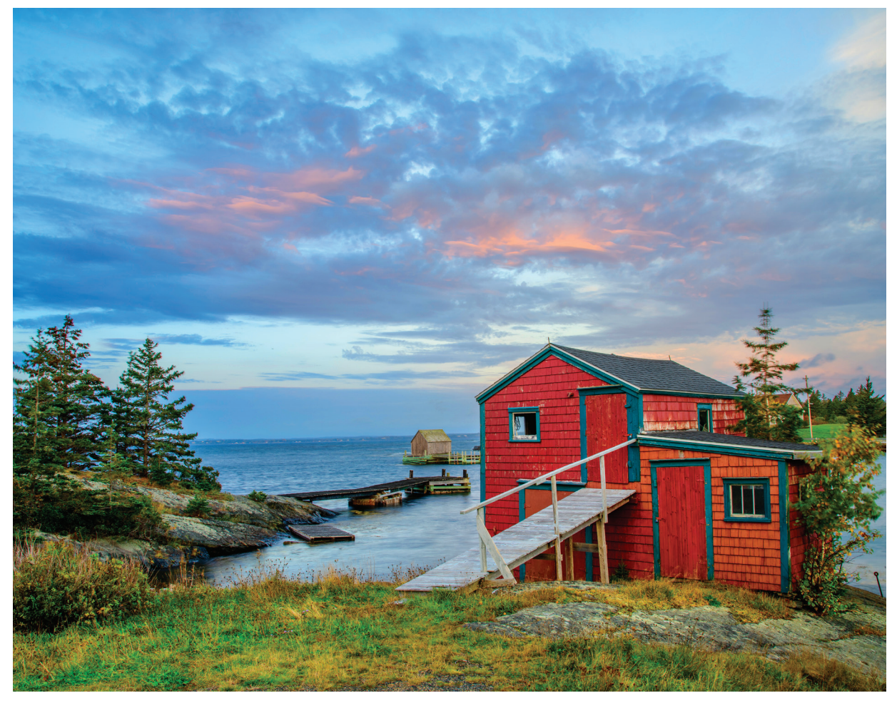
Typical rural scene in the Maritime province of Nova Scotia

Ratings are based on the Hotel & Travel Index, the travel industry standard reference. Unrated hotels may be too new, too small, or too remote to be listed.