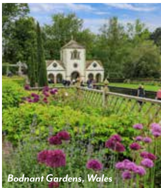
Bodnant Gardens, Wales

Enjoy a guided panoramic tour of Dublin, featuring St. Patrick's and Christ Church cathedrals, Trinity College, and the UNESCO-inscribed Book of Kells, an illuminated manuscript believed to have been created in A.D. 800. Cruise grand O'Connell Street, lined with statues of Irish statesmen. This evening, enjoy a presentation of traditional Irish music and dance on board. (B,L,D)