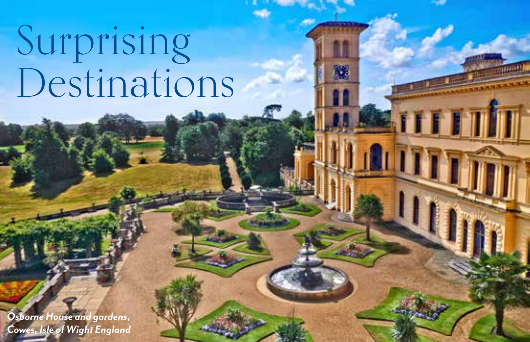
Osborne House and gardens, Cowes, Isle of Wight England

The seaside town of Cowes on the Isle of Wight is a festive harbor town known for its yachting culture and sailing races. Along with a lovely Parade and Esplanade, Cowes boasts a charming High Street filled with boutiques, galleries and restaurants (it is rumored that Cowes has more eateries per square mile than any other town in the U.K.!). More famously, Cowes is home to Osborne House, Queen Victoria's beloved vacation home. "It's hard to imagine a lovelier spot," the queen proclaimed. Yet many international travelers have not been here. And what about Tresco, on the Isles of Scilly? One of the first surprises about Tresco is that, even though it is situated off the chilly coast of Cornwall, it supports a subtropical garden filled with exotic plants, many of which bloom all year. Tour this lush parkland, built around a crumbling 11th-century abbey, and marvel at the thousands of plants. Another surprise? The Valhalla Museum located within the gardens, home to figureheads and other ships' carvings salvaged from area shipwrecks since 1840. These surprising delights — as well as many other lovely adventures — await you as you tour the British and Emerald Isles!