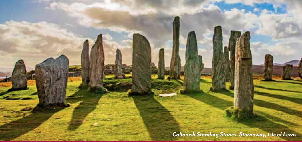
Callanish Standing Stones, Stornoway, Isle of Lewis

Belfast during the Troubles. Spend time with a local cab driver who will talk honestly about the Troubles. (B,L,D)