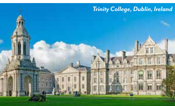
Trinity College, Dublin, Ireland

Following breakfast, disembark and transfer to the airport for your return flight. (B)