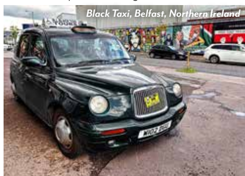
Black Taxi, Belfast, Northern Ireland