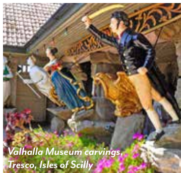
Valhalla Museum carvings, Tresco, Isles of Scilly

The seaside town of Cowes on the Isle of Wight is a festive harbor town known for its yachting culture and sailing races. Along with a lovely Parade and Esplanade, Cowes boasts a charming High Street filled with boutiques, galleries and restaurants (it is rumored that Cowes has more eateries per square mile than any other town in the U.K.!). More famously, Cowes is home to Osborne House, Queen Victoria's beloved vacation home. "It's hard to imagine a lovelier spot," the queen proclaimed. Yet many international travelers have not been here. And what about Tresco, on the Isles of Scilly? One of the first surprises about Tresco is that, even though it is situated off the chilly coast of Cornwall, it supports a subtropical garden filled with exotic plants, many of which bloom all year. Tour this lush parkland, built around a crumbling 11th-century abbey, and marvel at the thousands of plants. Another surprise? The Valhalla Museum located within the gardens, home to figureheads and other ships' carvings salvaged from area shipwrecks since 1840. These surprising delights — as well as many other lovely adventures — await you as you tour the British and Emerald Isles!